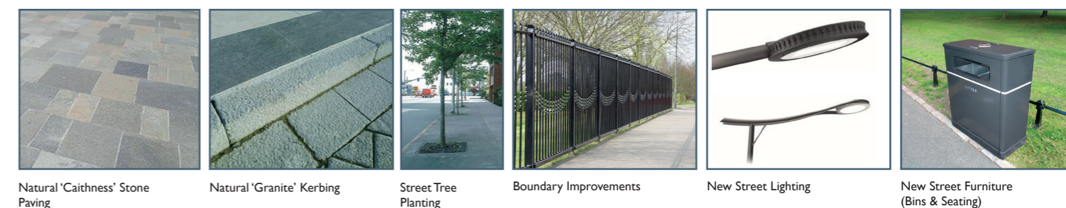
Natural 'Caithness' Stone Paving Natural 'Granite' Kerbing Street Tree Planting Boundary Improvements New Street Lighting New Street Furniture (Bins & Seating)