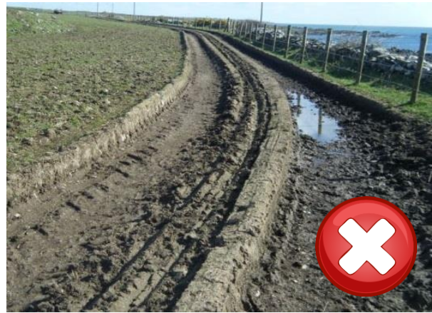
Vehicles can cause severe damage to soil structure