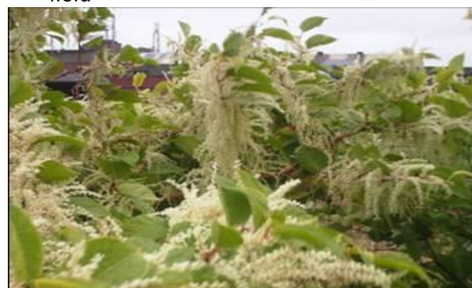
Japanese knotweed flowers