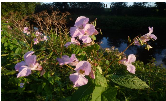
Himalayan Balsam Flower