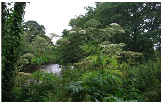
Giant Hogweed flowers (above).