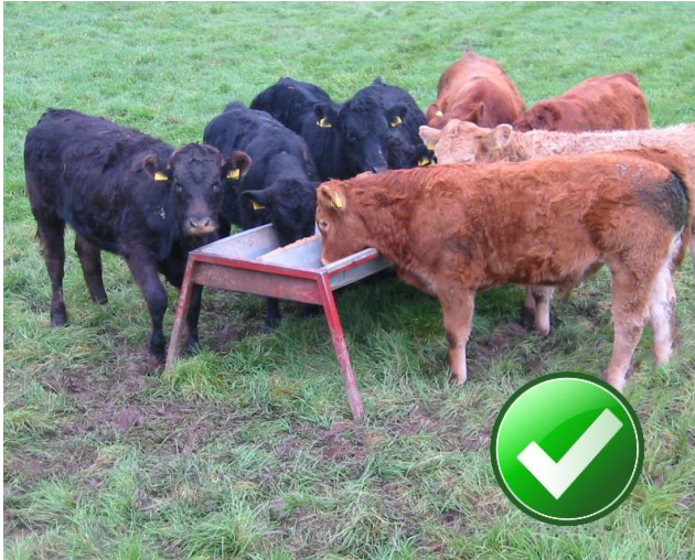
Acceptable supplementary feeding site