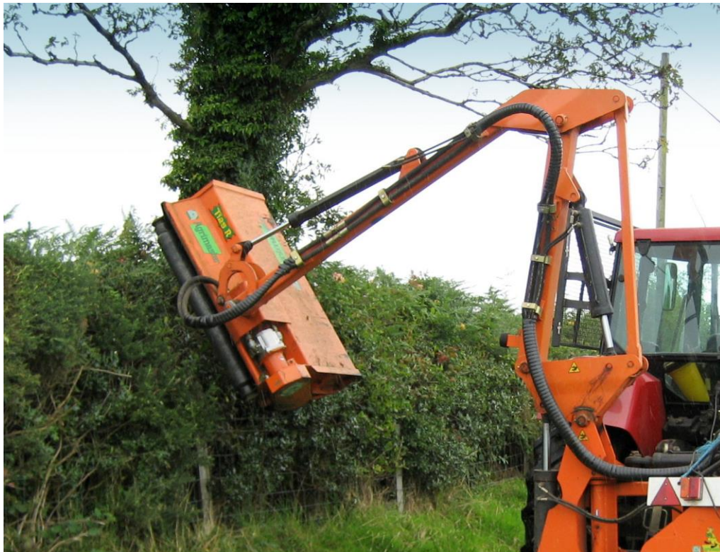
Field Hedge cutting cannot take place between 1 st March and 31 st August.