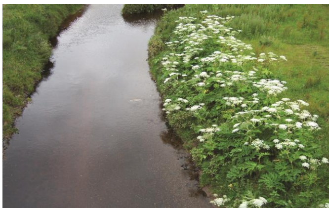
Giant Hogweed is often found along riverbanks.

further information please read the Best Practice Management Guide www.invasivespeciesireland.com