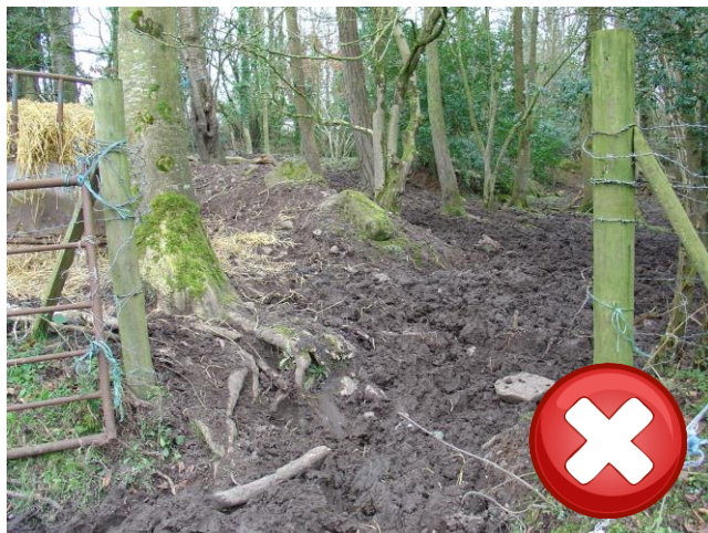
Feeding of livestock in broadleaved woodland is not permitted