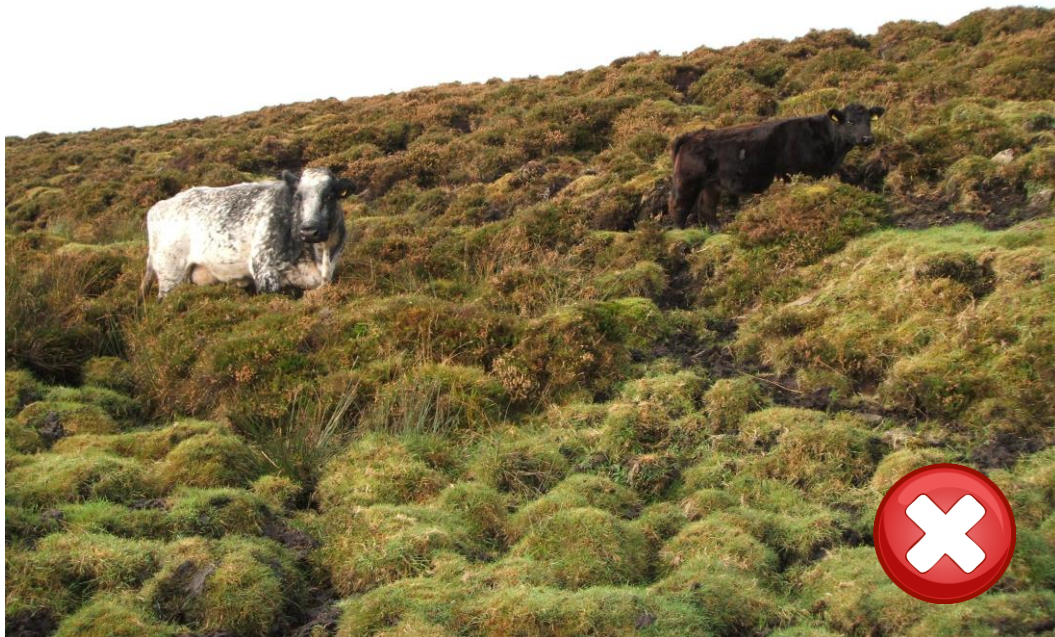
Overgrazing resulting in exposed peat soils at risk of erosion

livestock in such numbers which would damage the growth, quality or species composition of vegetation on that land to any significant degree.