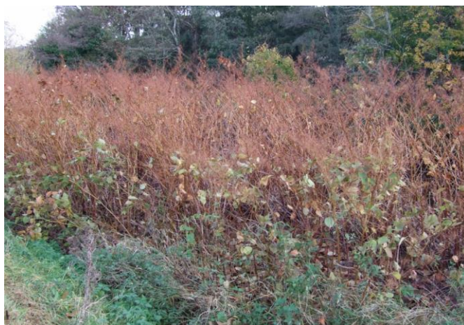
Japanese knotweed encroaching into a field