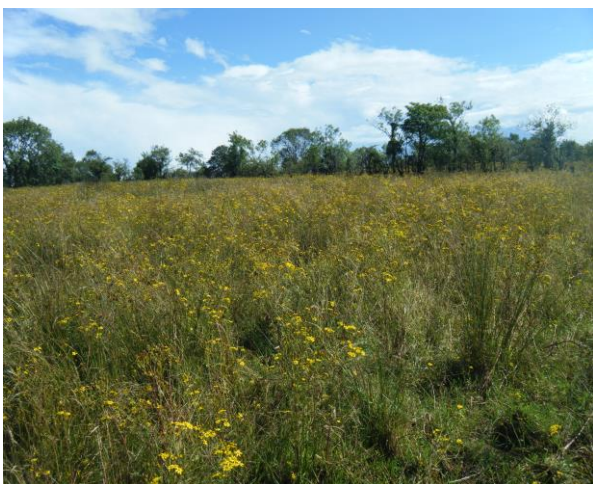
Ragwort (left) and Thistle (right).

https://www.daera-ni.gov.uk/publications/guidance-leaflet-nw10-herbicides-control-noxious-weeds-grassland .