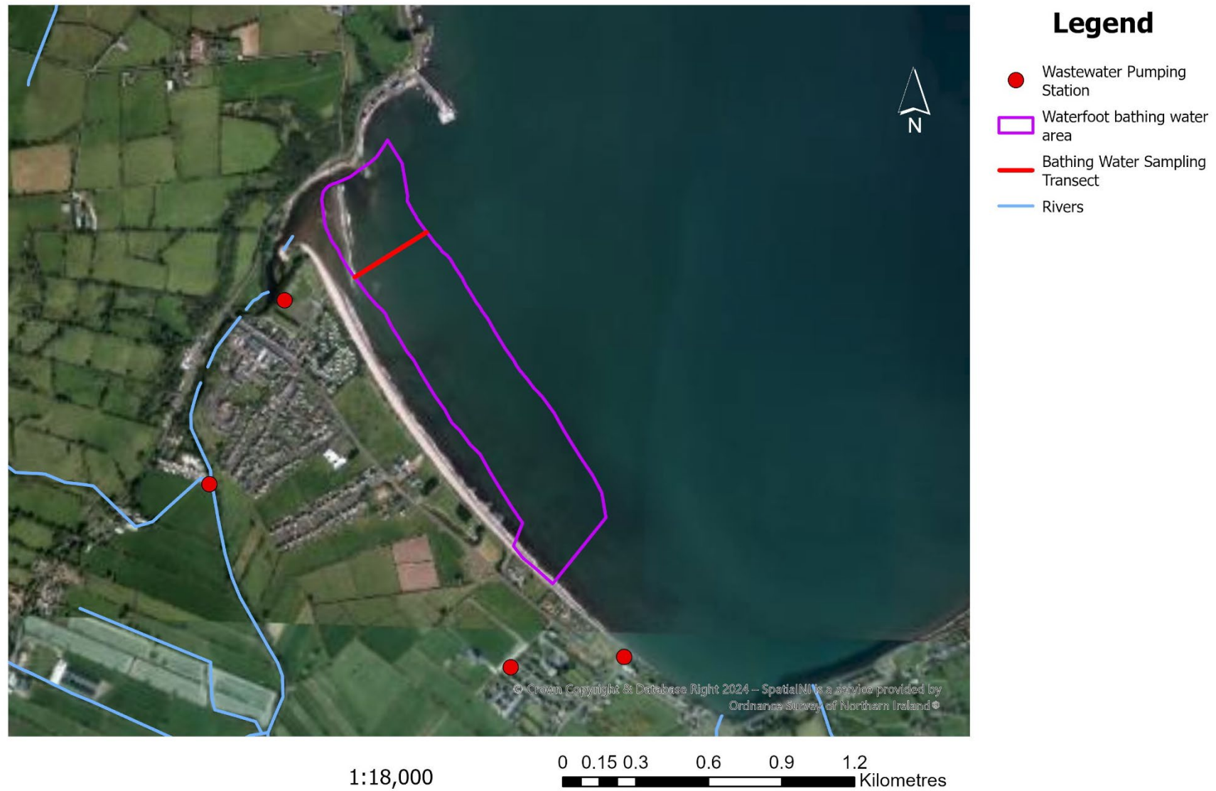
Map 1 Waterfoot Bathing Water