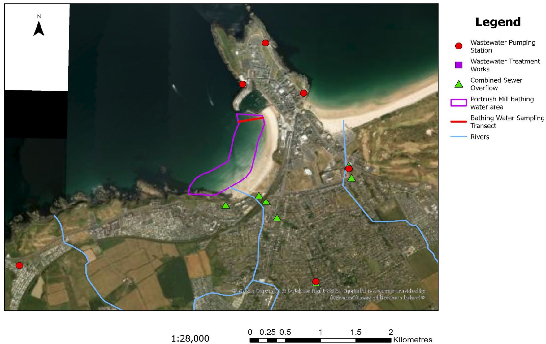
Map 1. Portrush Mill Bathing Water