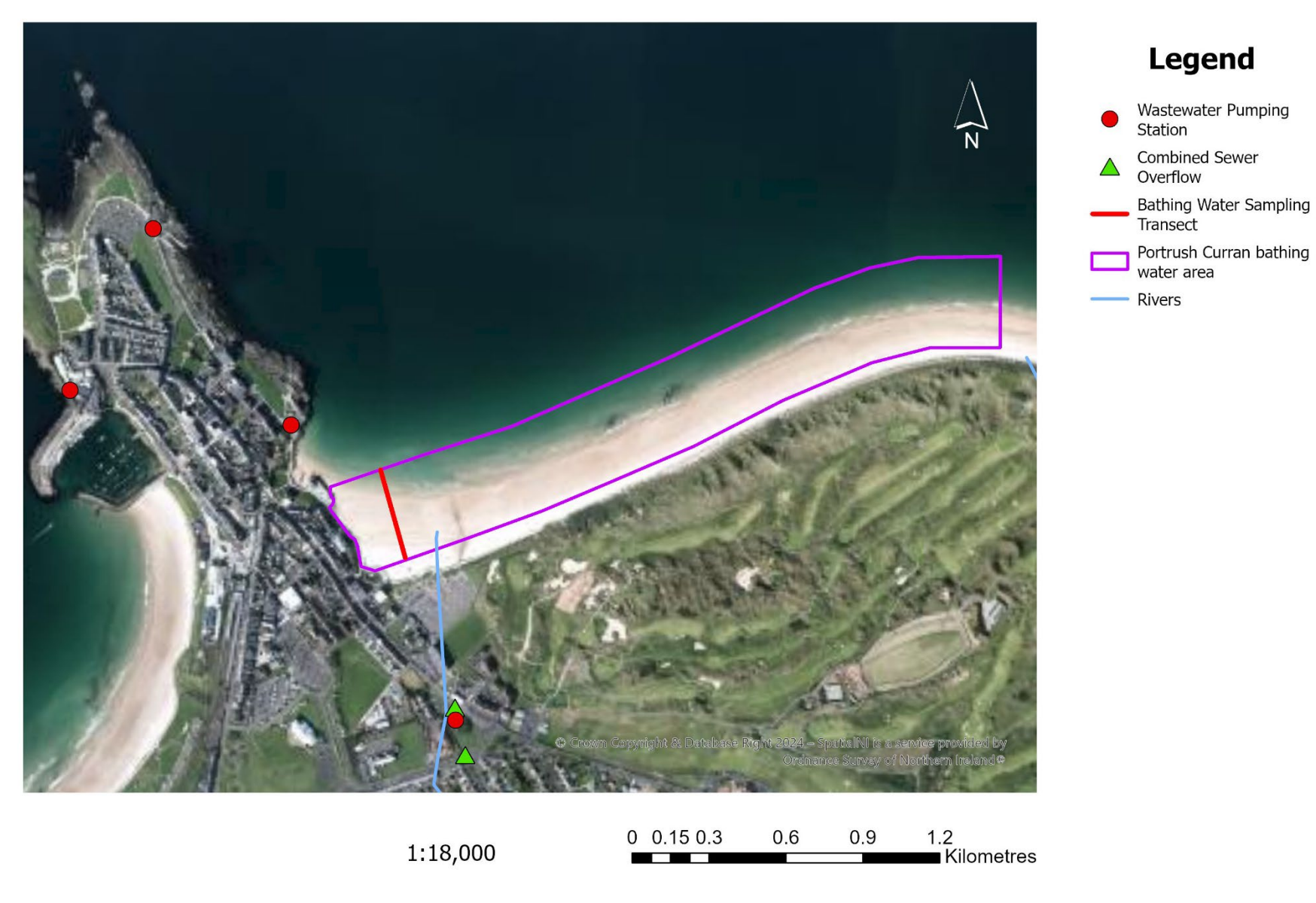
Map 1 Portrush Curran Bathing Water