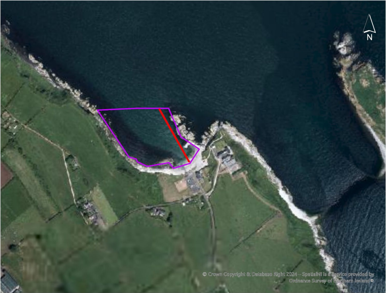
Map 1 Portmuck Bathing Water