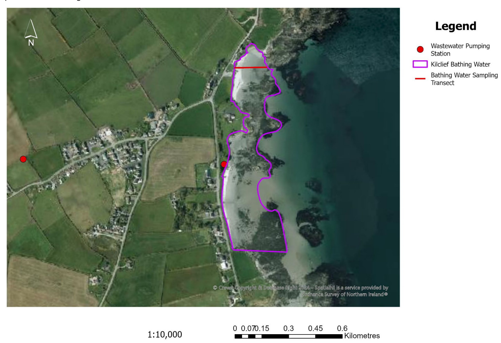
Map 1 Kilclief Bathing Water