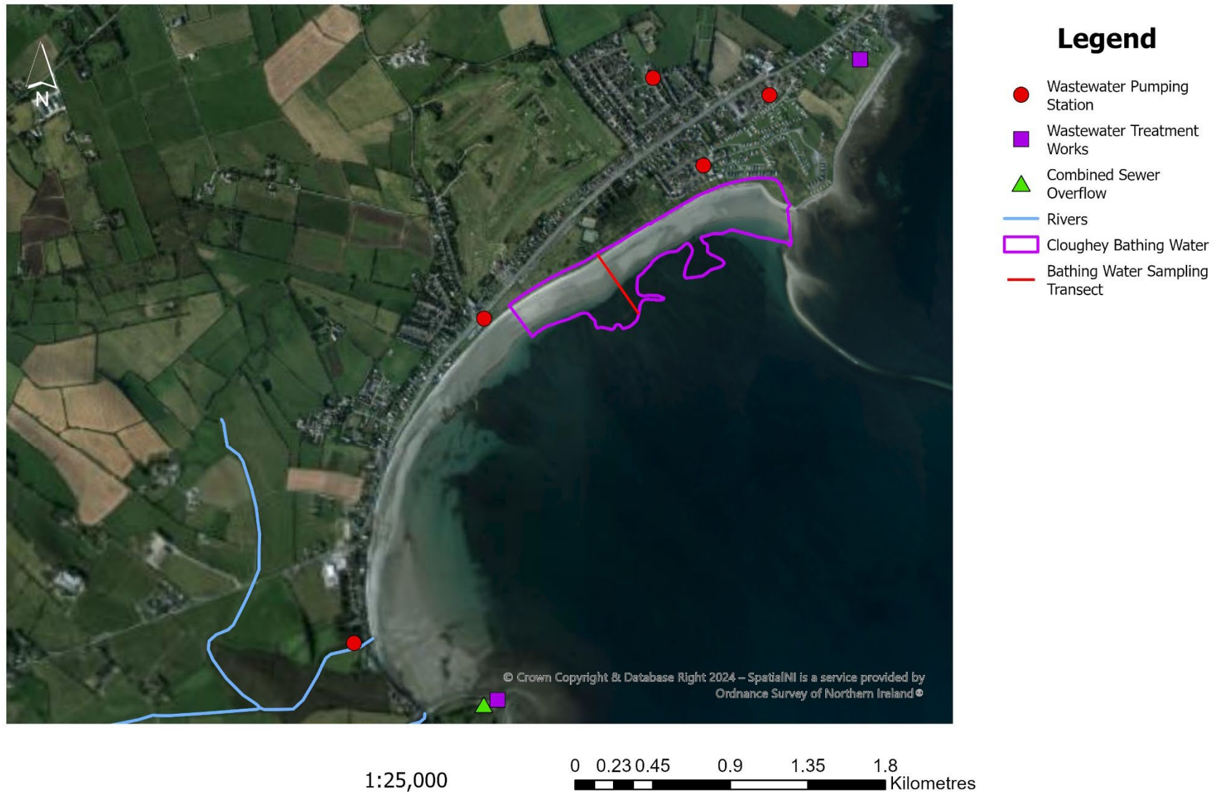
Map 1 Cloughey Bathing Water