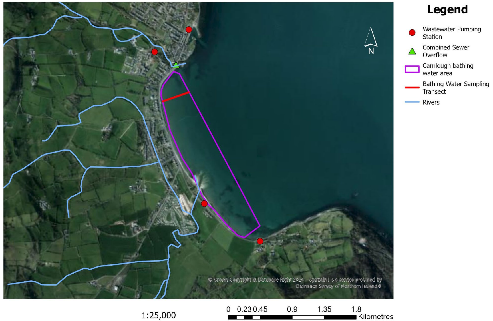
Map 1 Carnlough Bathing Water