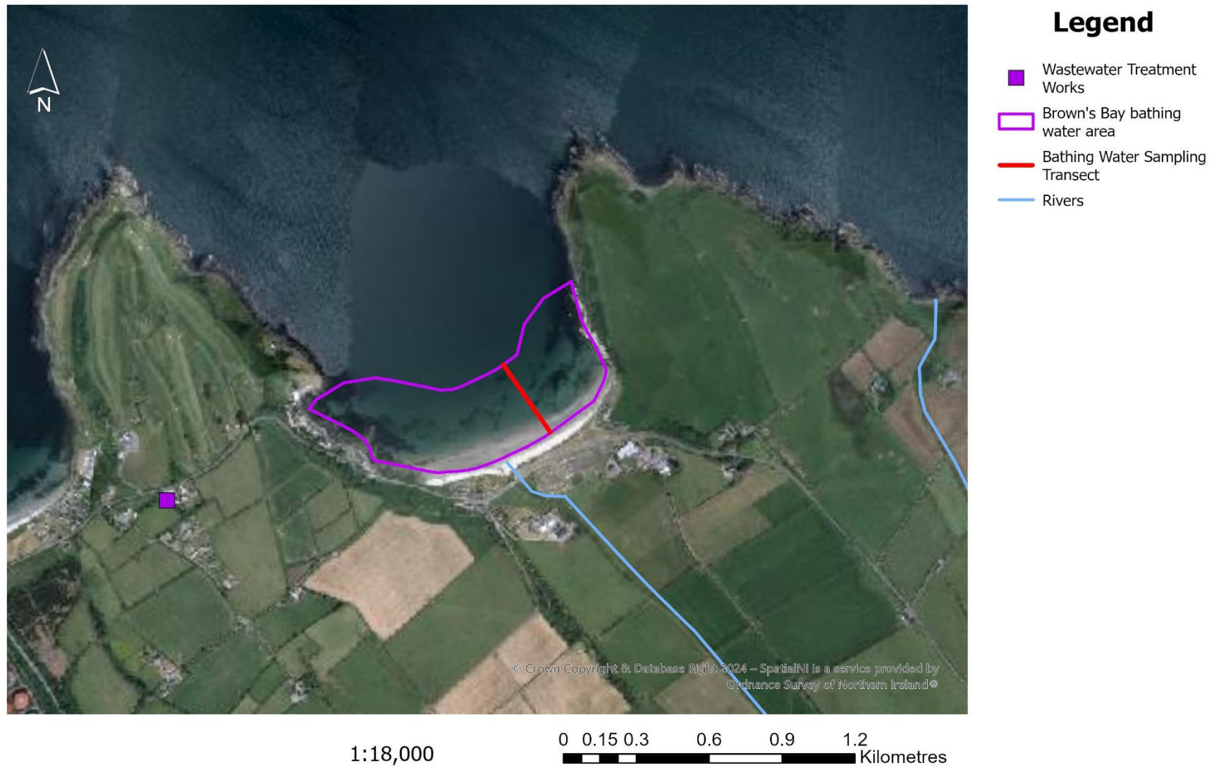
Map 1 Brown's Bay Bathing Water