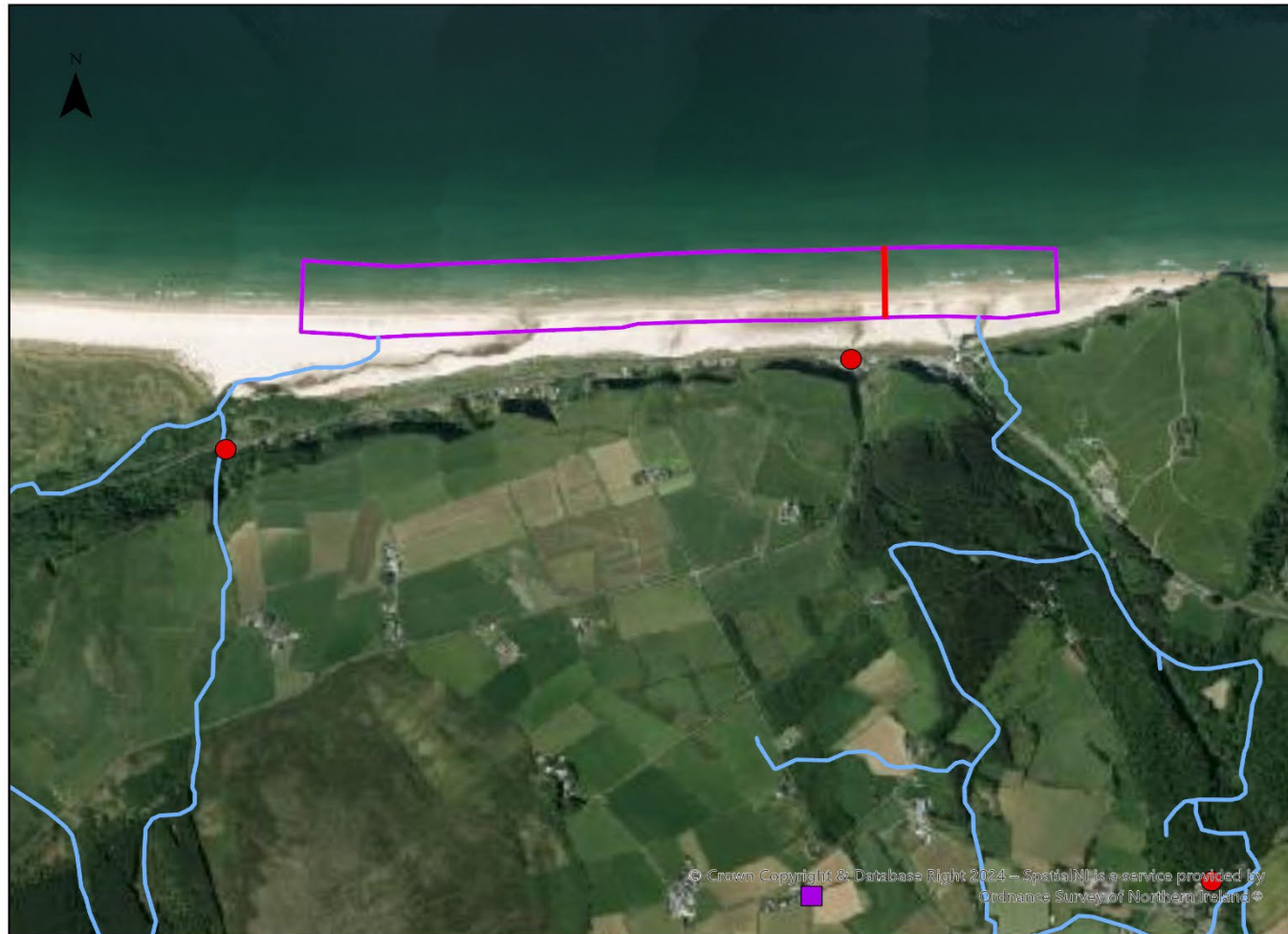
Map 1 Magilligan Downhill Bathing Water