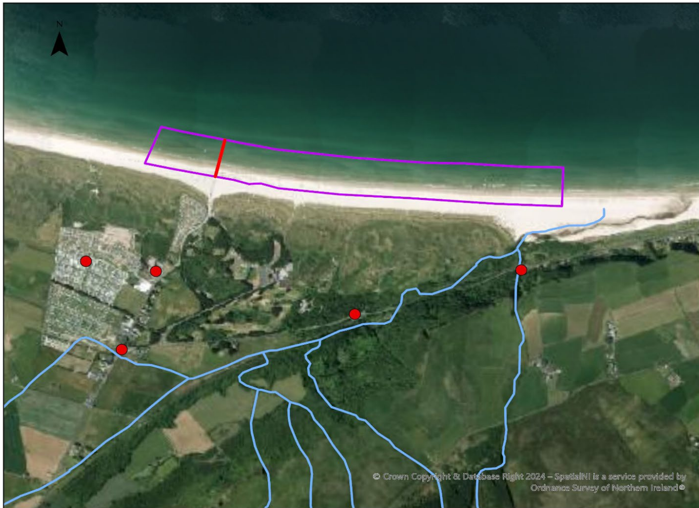
Map 1. Magilligan Benone Bathing Water