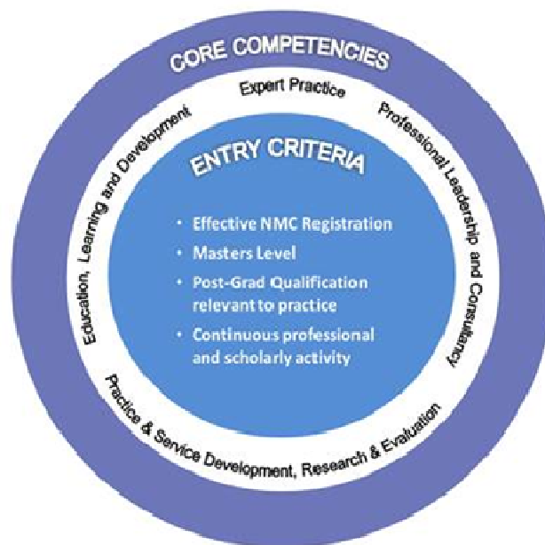
Figure 1. Entry criteria and core competencies for Consultant Nurse and Consultant Midwife Roles