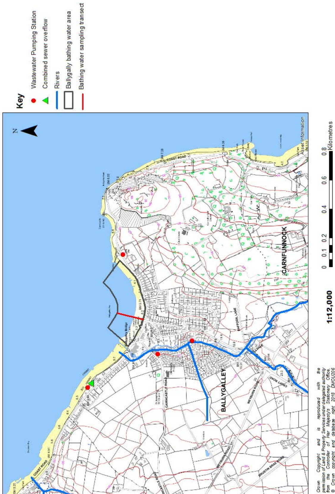
Map 1 Ballygally Bathing Water - Potential Pollution Sources

Crown Copyright and is reproduced with the permission of Land & Property Services under delegated authority from the Controller of Her Majesty's Stationery Office. © Crown copyright and database right 2018. DM00206