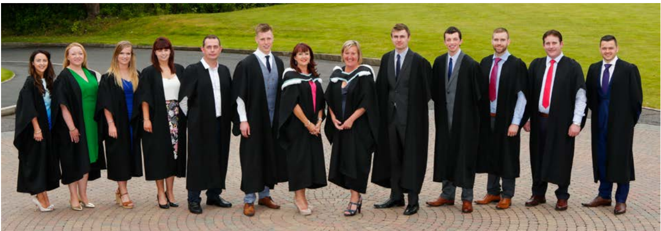
One of the FUSION graduations in 2016

FUSION is InterTradelreland's flagship technology transfer programme which provides companies with new product or process development needs access to a three-way partnership that includes a third-level research institution with specialist expertise and a high-calibre science or technology graduate.