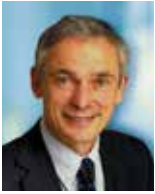
Richard Bruton TD MINISTER FOR JOBS, ENTERPRISE AND INNOVATION