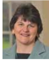
Arlene Foster MLA MINISTER FOR ENTERPRISE, TRADE AND INVESTMENT