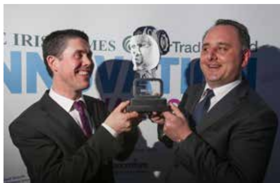
Innovation Awards winner 2013 - Trustwater, Co. Tipperary.

The awards ceremony for the 2013 Irish Times InterTradeIreland Innovation Awards took place on Friday 22nd March at the Titanic Building in Belfast. The 'Innovation of the Year' winner was Tipperary-based firm Trustwater for their unique system used by bottling plants to dramatically reduce energy and water usage.