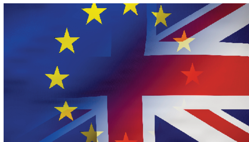
Image 1: Brexit has now been delayed for the third time until 31 January 2020

Prime Minister Boris Johnson does not have a majority in parliament and his government would have struggled to pursue its agenda so by calling a General Election he is hoping to break the Brexit stalemate. With the three month extension to Brexit now in place and the 'no deal' option off the table opposition parties have voted in favour of a national poll.