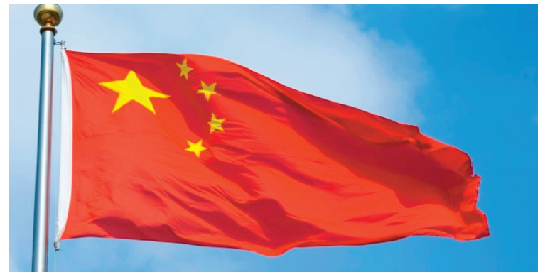
Image 1: Beef produced in Northern Ireland could arrive in China before the end of the financial year

"It is important to build on the opportunities that China can offer on behalf of beef farmers throughout Northern Ireland."