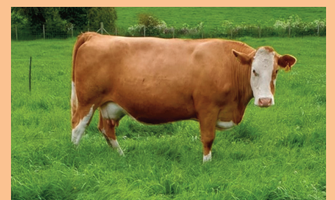
Image 2: More support is needed for the Northern Ireland suckler industry

There is no reason why the size of the suckler herd in Northern Ireland cannot be increased significantly. Quality beef from suckler herds in Northern Ireland with excellent sustainability credentials must continue to be available to supply discerning customers in domestic and overseas markets.