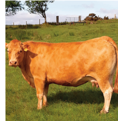
Image 1: The EU-Mercosur deal will give South American countries a Tariff Rate Quota (TRQ) of 99,000 tonnes (cwe) to the EU market for hormone free beef.

is pre-agreed by the four Mercosur countries and is based on the historic amounts registered over the last three years.