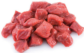
Image 1: Declines in volume sales of beef have been offset by higher retail prices and a changing product mix

The number of households buying beef has also recorded a slight increase during the 2018 period with market penetration at 83.7 per cent. This is up from 83.1 per cent in the same period in 2017. Alongside this increase in household penetration there has been