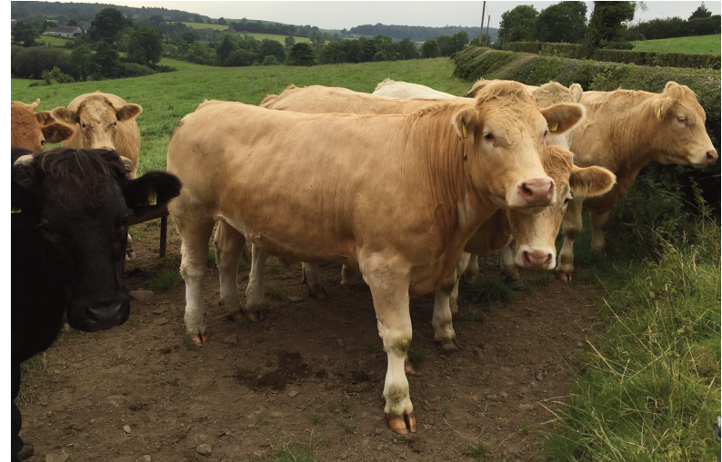
Image 1: During 2018 41 per cent of price reported prime cattle in NI came from less than 200 finishers.

In 2016 producers killing over 200 prime cattle presented 36 per cent of the price reported kill for slaughter. This increased to 40 per cent in 2017 and increased slightly in 2018 to 41 per cent. Larger producers have the ability to negotiate better on price than smaller finishers when presenting cattle for slaughter at the processing plants due to the more consistent supply of cattle that they finish.