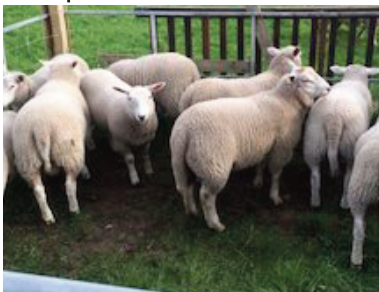
Image 1: Both the liveweight and deadweight lamb trade in NI has come under pressure in recent weeks

Favourable production conditions this year have improved lamb performance and have meant lambs were ready for slaughter earlier with the supply of lambs currently running ahead of demand from key market outlets. Weaker demand for lamb in France in particular has had a negative impact on the local lamb trade. Reports have indicated that weaker consumer demand in the region combined with increased levels of imports from Spain and rising domestic production have all contributed to the drop in import demand.