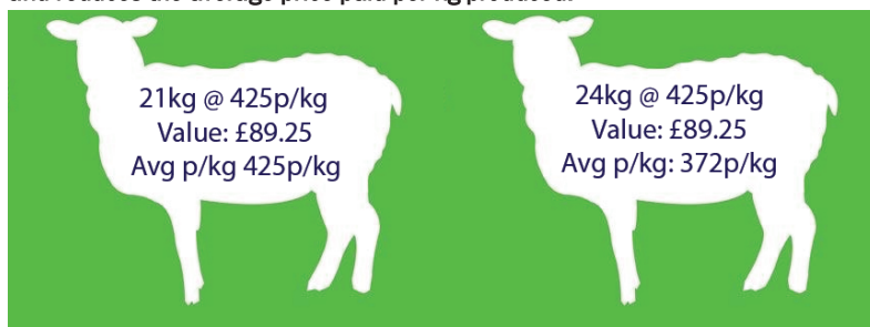
Figure 2: Producing heavy carcasses provides no financial return for the producer and reduces the average price paid per kg produced.

of retailer and customer specifications and are therefore more marketable.