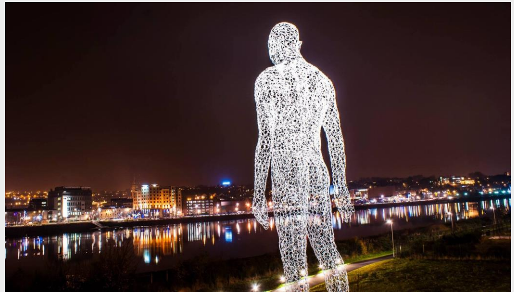
Derry Londonderry UK City of Culture 2013