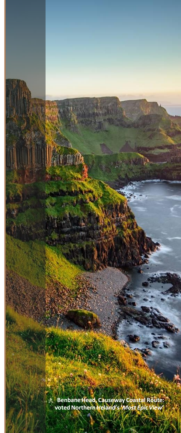
Benbane Head, Causeway Coastal Route: voted Northern Ireland's 'Most Epic View'

Alongside this openness, there is a new willingness to share. As a legacy of The European Year of Cultural Heritage (2018) Historic Royal Palaces and National Museums Northern Ireland continue to lead a consortium of heritage operators of all shapes and size,