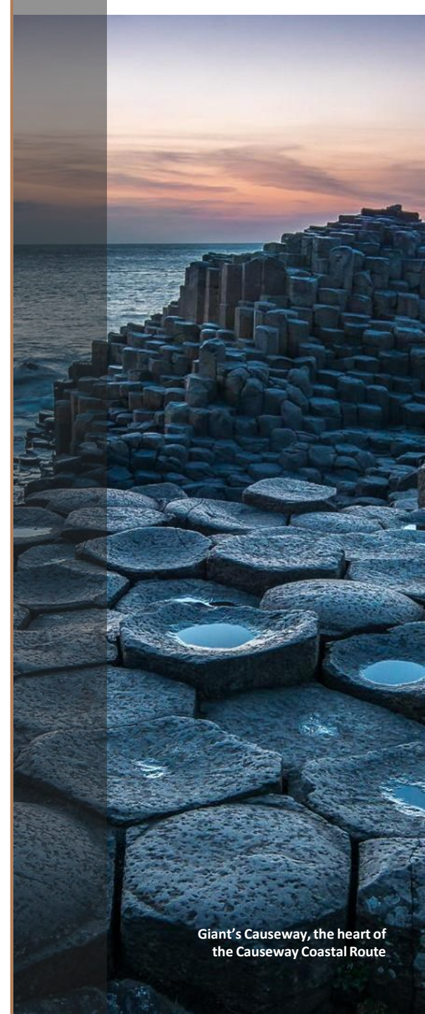
Giant's Causeway, the heart of the Causeway Coastal Route

Seize the game changer moments. Northern Ireland's tourism is young, but with some well-defined major attractions – these are amongst your quick wins. So, put immediate energies into making