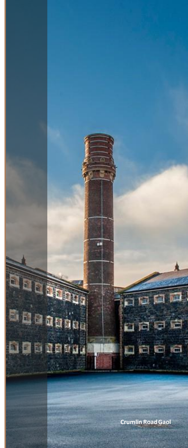
Crumlin Road Gaol

We want Northern Ireland and its diverse and dynamic heritage and culture to be an obvious first-choice, 'must-see' destination for culturally motivated travellers.