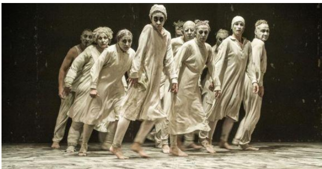
May B, Maguy Marin Dance Company, Happy Days Festival

In other words, connecting the dots for visitors in a way that makes sense, excites and can be easily accessed. By weaving the epic and the 'hidden gem' stories together through the undeniable heritage assets, Northern Ireland's narrative can stand apart as internationally distinctive but also personal – using the country's character and characters to project a vibrant, relevant, fresh and edgy heritage. This can only be achieved by embracing cultural programming alongside interpretation – the literary festival celebration of Samuel Beckett ( www.happy-days-enniskillen.com ) being a great case in point, which ran until 2015 and continues to inform cultural programming through leading producers like Séan Doran. As The Guardian put it: “a festival filled with good surprises”. This is just one indicator of the strategic challenges in embedding consistent, reliable and long-term funding and investment in culture and heritage where it can make a cultural and economic difference.