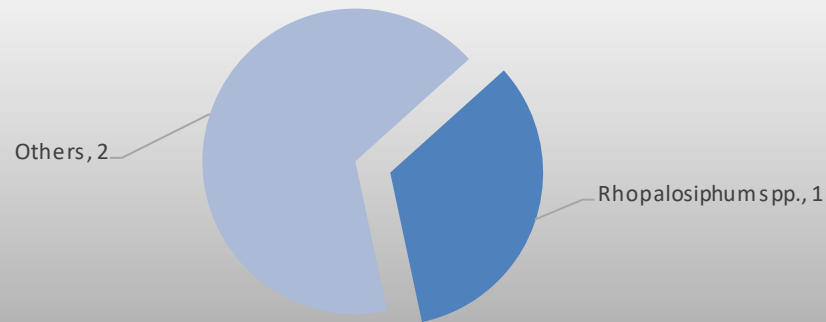
Suction Trap W/E 22/11/19