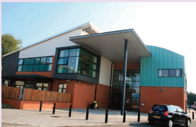
Jethro Centre Shankill Parish Lurgan