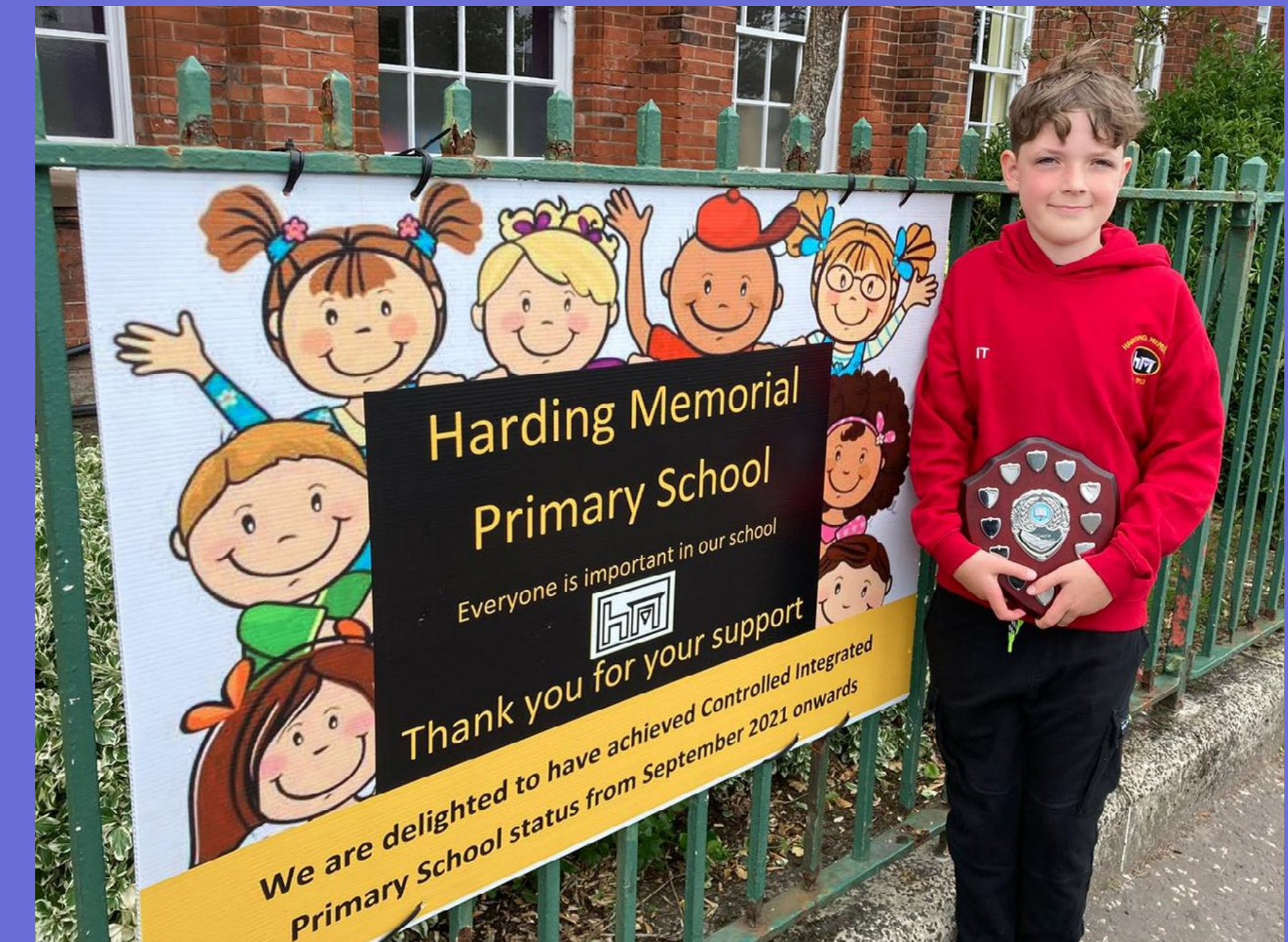
Harding Memorial Integrated Primary School (formerly Harding Memorial PS), Belfast.

The staff team at Seaview Integrated Primary School, celebrating their new status, name, logo and sign!