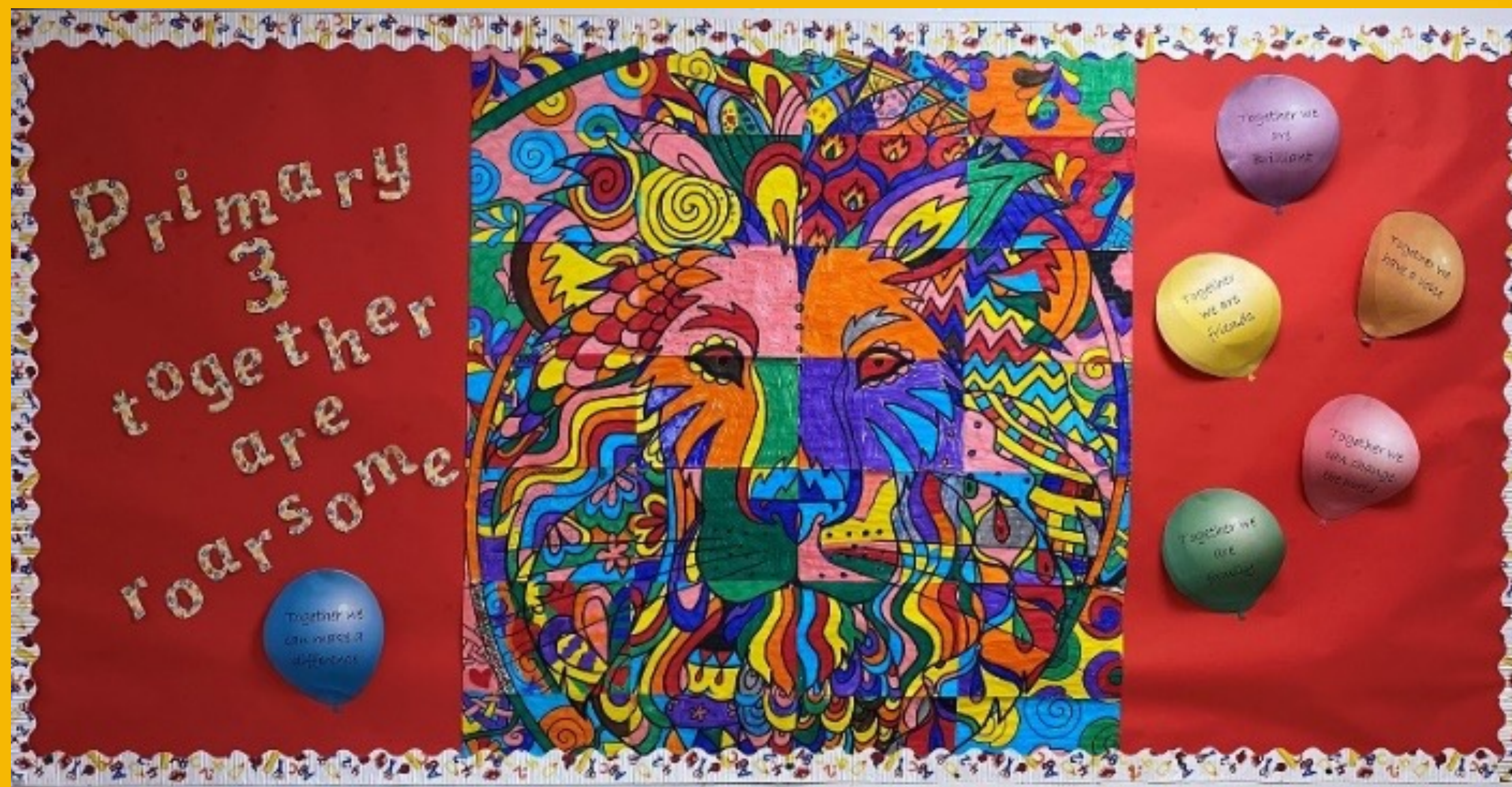
Pupils at Crumlin IPS combined their art together to create this 'roarsome' display!

Integrated schools marked Integrated Education Month in March 2021 , finding innovative and heart-warming ways to feel togetherness, when schools had been closed to most pupils since January.