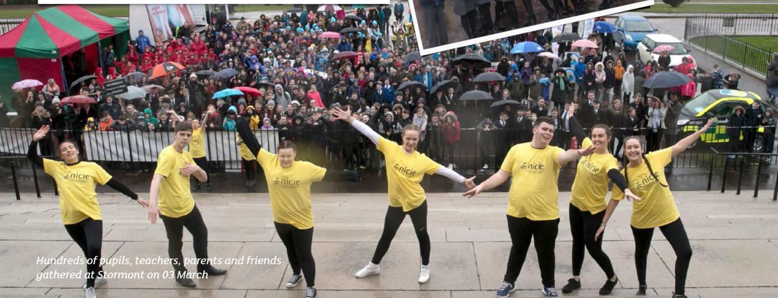
Hundreds of pupils, teachers, parents and friends gathered at Stormont on 03 March