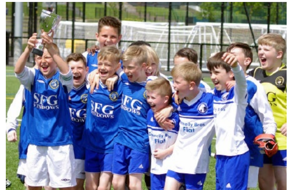
Glengormley IPS victorious soccer team celebrating their fifth successive win in the Integrated Schools Cup

The theme of sport for all was developed in classrooms during the remainder of the week with children studying sports from different cultures around the world such as Boules, Kabbadi, Aussie Rules and even Sumo Wrestling!