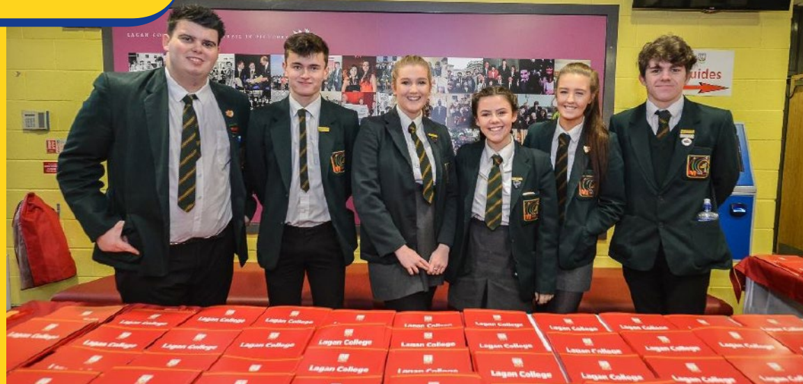
Senior students at Lagan College which will expand its sixth form from September