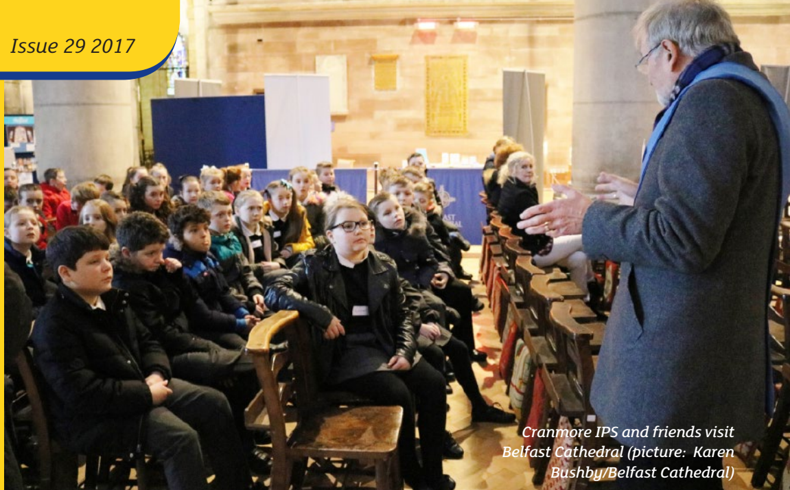
Cranmore IPS and friends visit Belfast Cathedral