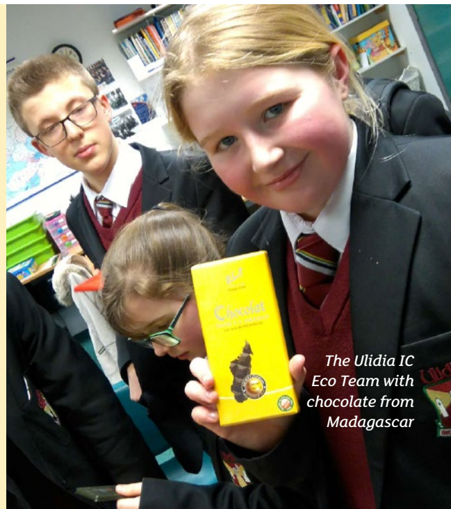
The Ulidia IC Eco Team with chocolate from Madagascar

The two schools have been exploring fair trade. The Lycée Pôle Fort-Dauphin students have been exploring the production of commodities such as sugar and cocoa in their local community. The Ulidia IC team has been looking at the fair trade consumption of these products and the disposal of the packaging that they are sold in. The resulting article will be published on both school websites.