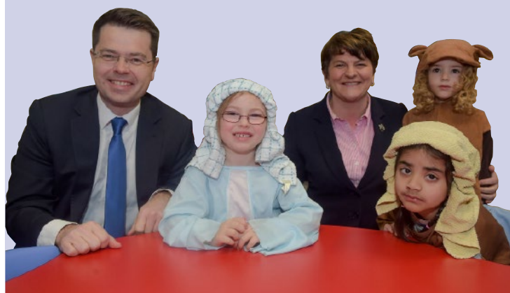
Secretary of State, James Brokenshire MP, and Arlene Foster MLA, with Enniskillen IPS pupils

The IEF has helped to fund the expansion of Enniskillen IPS by providing an additional classroom and supporting the extension of pre-school provision to help meet growing parental demand.