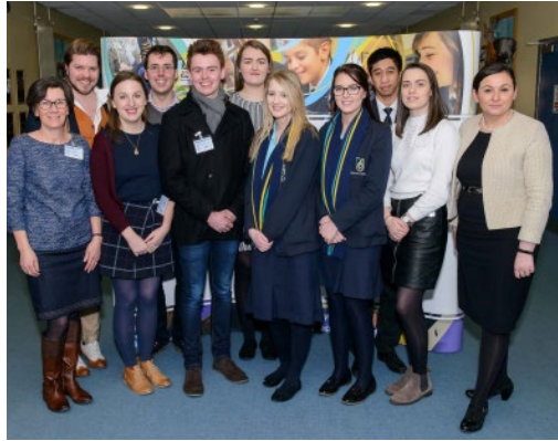
AlumNI group with students and staff at Sperrin IC

Integrated AlumNI unites former pupils and other supporters of integrated education who are keen to raise their voices and advocate for integrated education in Northern Ireland. Through support from the IEF, together with the Open Society Foundations, there are now active groups in Belfast, London, Liverpool, and Edinburgh, and developments are under way for further groups in Manchester, Dublin and Derry/Londonderry. The Belfast Trust for Integrated Education (BELTIE) are also generously supporting the development of the Belfast group.