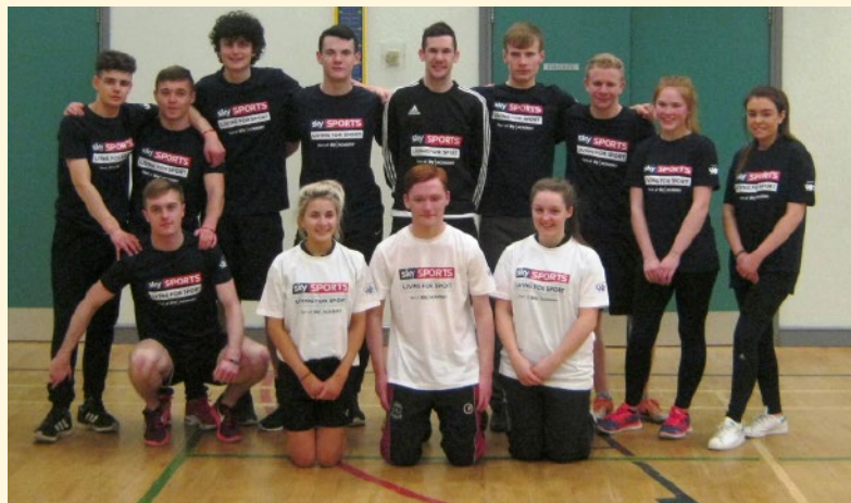
Olympic star Dr Michael McKillop (back row centre) at Ulidia IC

This was to be Michael's last visit to the college as the Sky Ambassador programme is coming to an end and the staff and pupils are very grateful for all the support he has given. They will be watching his career and wishing him well as he goes for his final goal - gold in Tokyo in 2020.