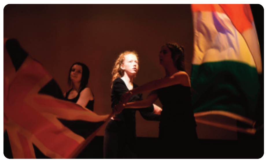
Performers from Brownlow IC