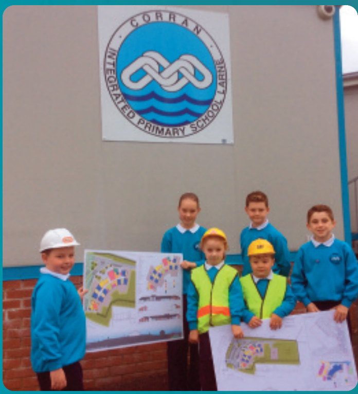
Corran IPS is marking a quarter of a century with a series of celebrations but most of all everyone is looking to the future as a new, permanent school building is on the horizon. The school opened in 1991 on an industrial site in Larne town before moving to the current location. Their new home should be ready for the next school year and everyone is looking forward to modern facilities with a fantastic view. "Corran" means crescent shaped and the curved design of the fabulous new building reflects this perfectly.