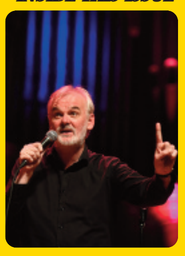
Stars stand up for the IEF Fresh Start promises new school buildings Integrated schools shine at Carson showcase