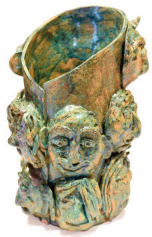
Ceramic from Blackwater IC from a project supported by a Carson Bursary

Applications for the next round of Carson Bursaries must be in by 3pm on Friday 25 November. You can find out more and see more photos from the Carson Awards showcase at www.ief.org.uk