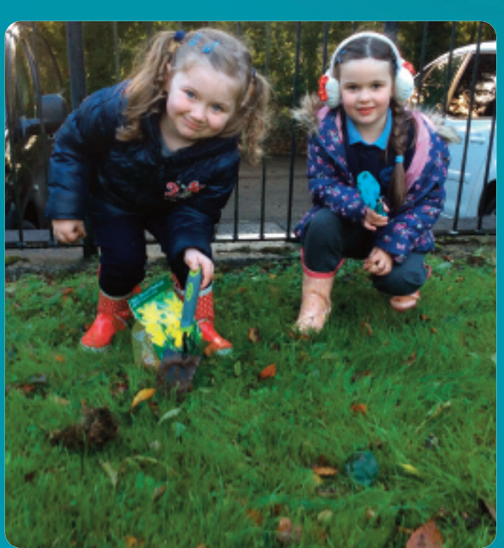
Carhill IPS transformed in 1991 and began the celebrations with an afternoon planting seeds and bulbs to symbolise growth and new beginnings