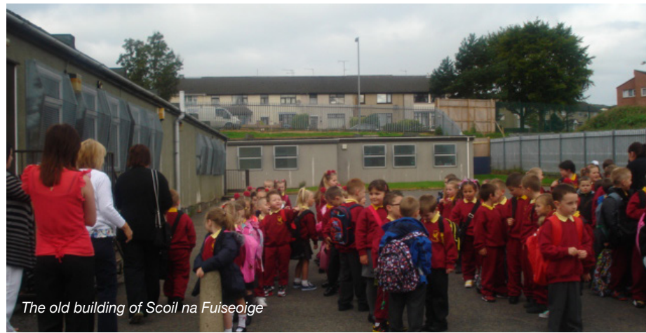
The old building of Scoil na Fuiseoige