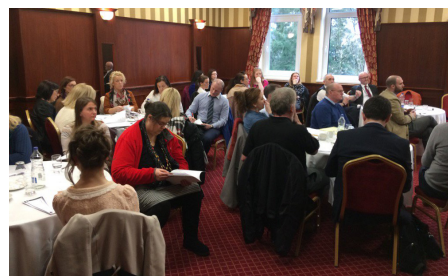
Attendees at February's IM Principals' Forum

It is hoped that in the near future a co-ordinator will be appointed to administer the work of the Learning Community; in the meantime CnaG will provide an officer to facilitate the workings of this new initiative.