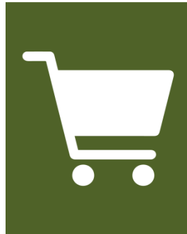
Retail sale in non-specialised stores