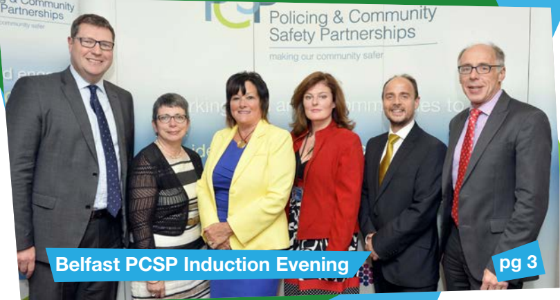
Belfast PCSP Induction Evening