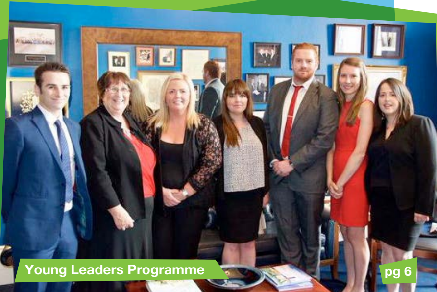
Young Leaders Programme