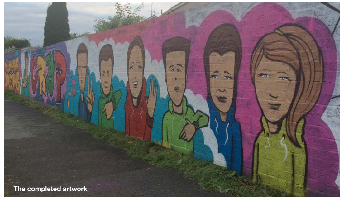
The completed artwork