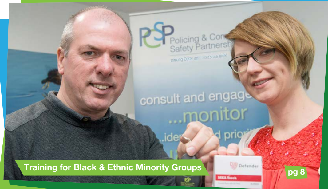
Training for Black & Ethnic Minority Groups