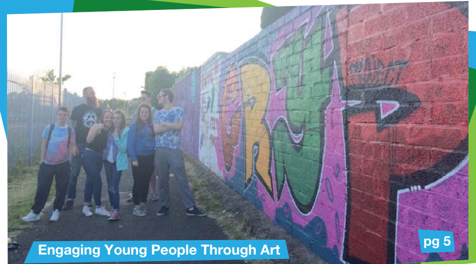
Engaging Young People Through Art