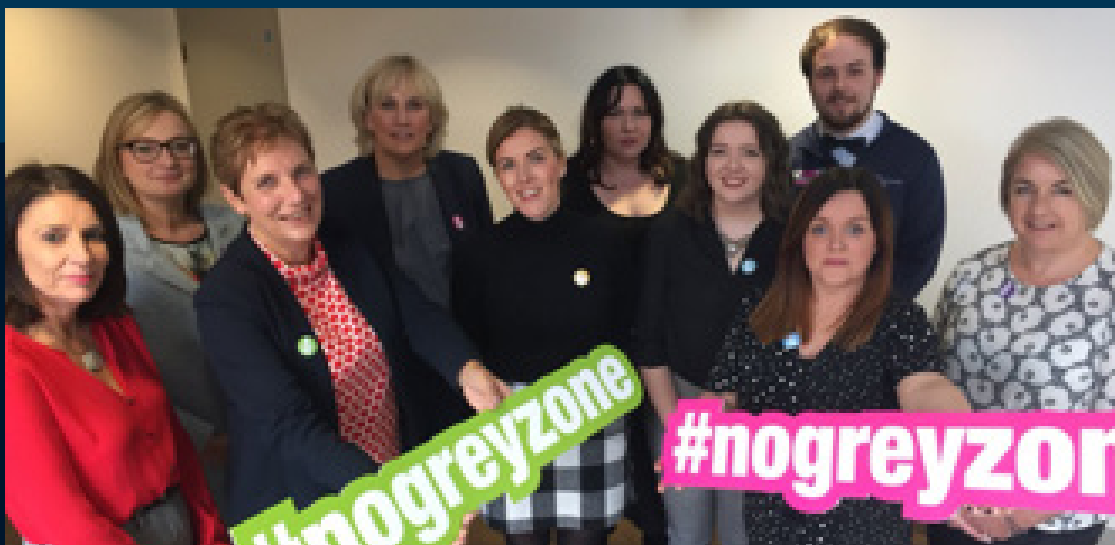
Many voices joined together to raise awareness of sexual consent and empower people to be #ConfidentAboutConsent. Be part of the movement and start talking about sexual consent now.

click here to find out all about the campaign.