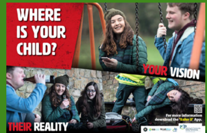
Where is your child campaign

Action: The PCSP has been focussed on improving the safety in the Night Time Economy (NTE) and welcoming more visitors. Mid Ulster has the second biggest night-time economy outside of Belfast and PCSP members have been working closely with coach companies and local vintners to reduce the number of people being dropped off in the town who have been drinking to excess. The impact of this is that PSNI recently announced that the crime profile for the NTE has changed from violent crime to low level crime.