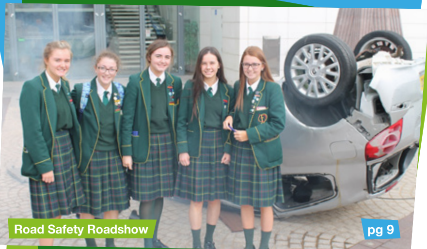
Road Safety Roadshow