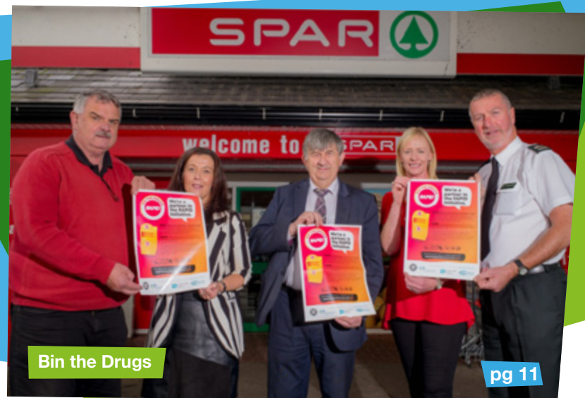
Bin the Drugs