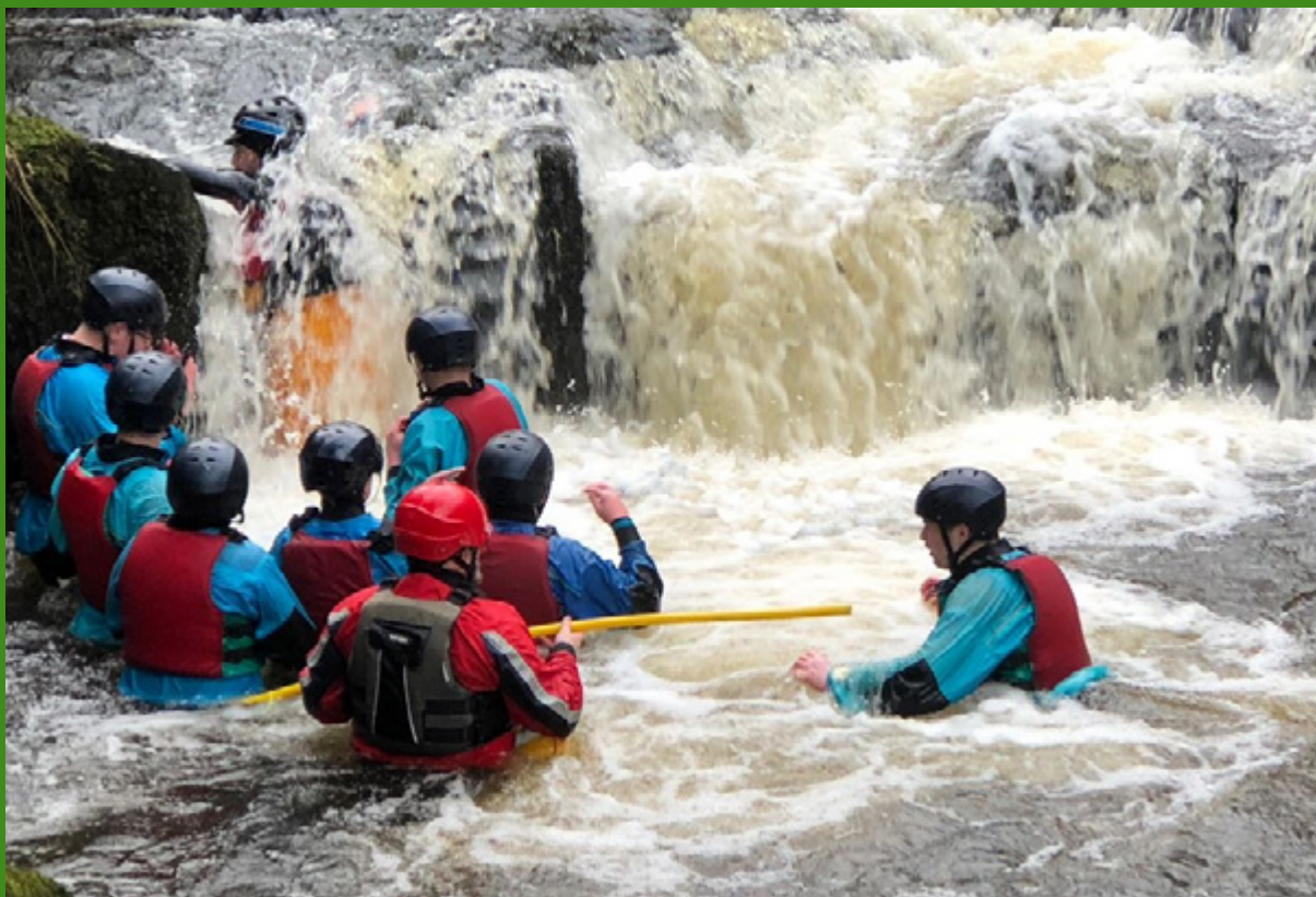
Dungannon Youth Education Project