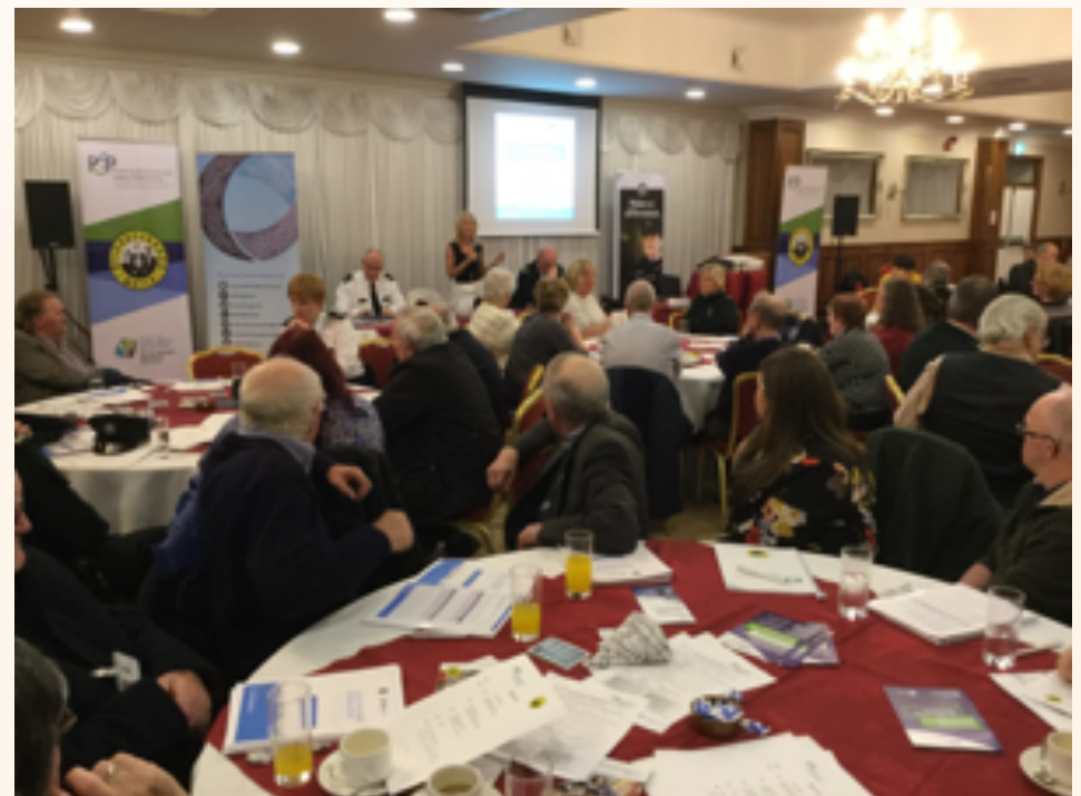
There was a great turnout at the local policing consultation in the Burrendale Hotel, Newcastle, for the meeting hosted by Newry, Mourne and Down PCSP.