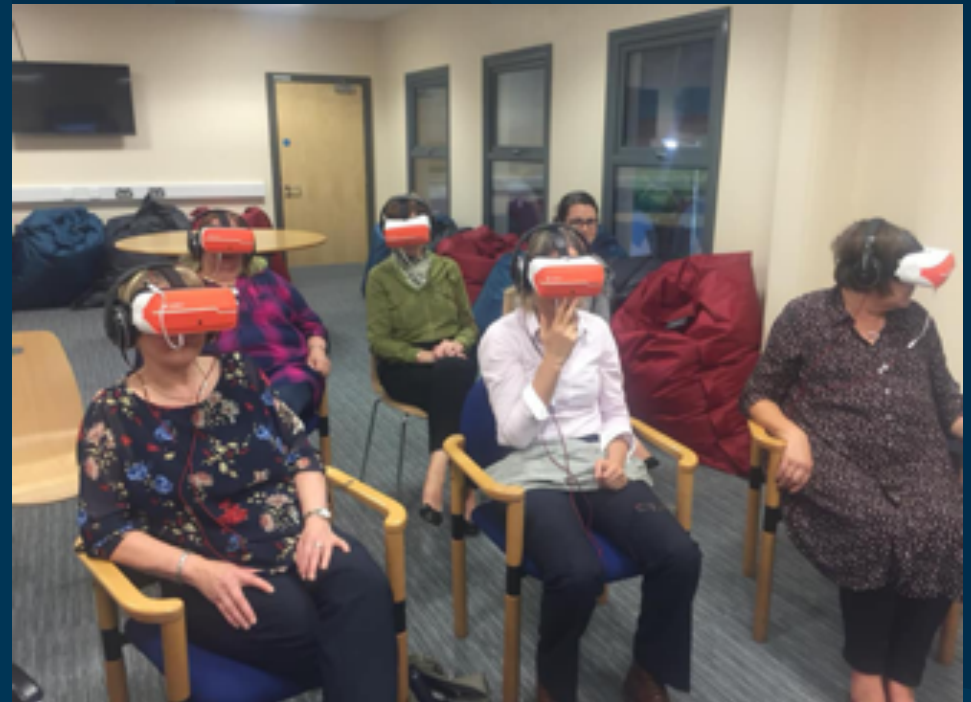
PCSP Members took part in the NIFRS new virtual reality programme 'YOUR CHOICE'