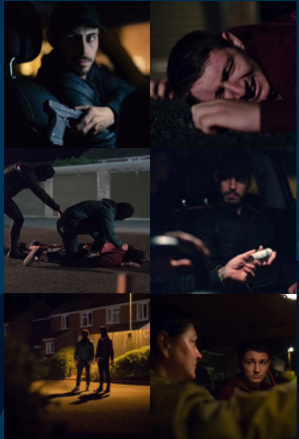
Images from the new campaign

Find out more about the campaign at www.endingtheharm.com .