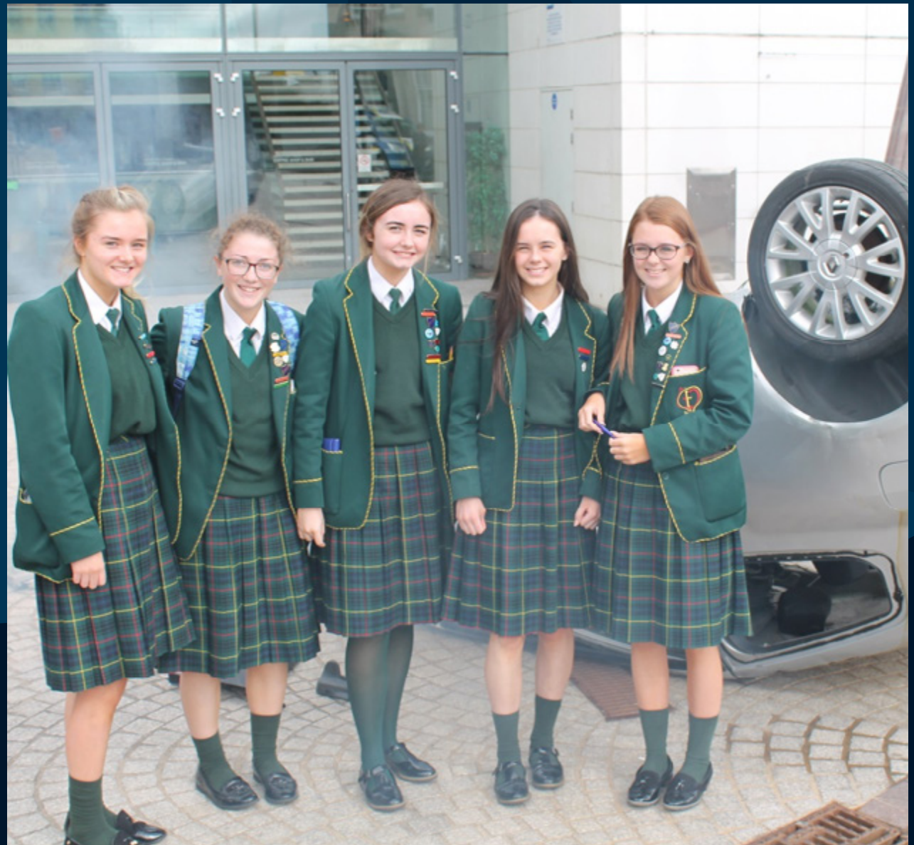
Students from St Catherine's College who attended the recent Road Safe Roadshow held in Armagh.

The Roadshow graphically depicts how a night out can end in tragedy and permanent disability. The story is told, not by actors, but by real emergency services first responders including a police officer, a paramedic and a fire officer, and tells the tragic story of a young woman, who was paralysed following a horrific collision.