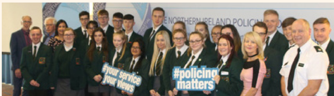
We had great engagement from students from Lagan College at our Local Policing Review.