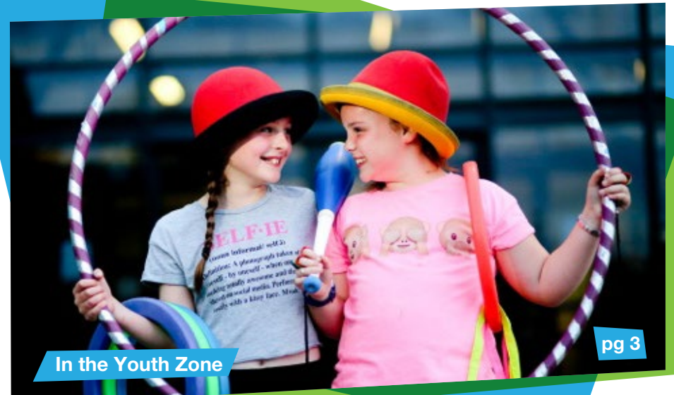
In the Youth Zone