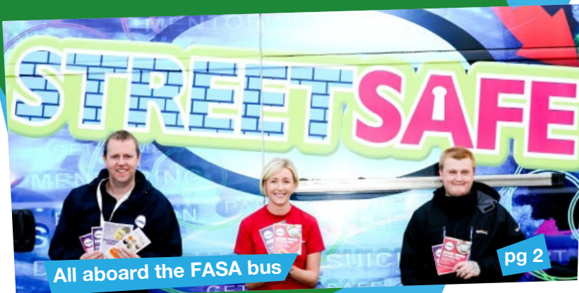
All aboard the FASA bus