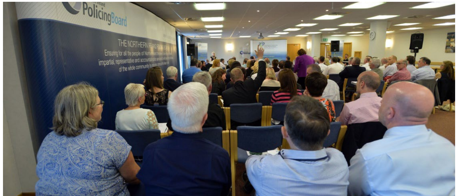
Some of the new PCSP members hearing more about their role at an induction event in the Policing Board.

She said: "Too many people are being killed and seriously injured through road traffic collisions and we need to be much more aware of what we can all do to prevent these tragedies from happening."