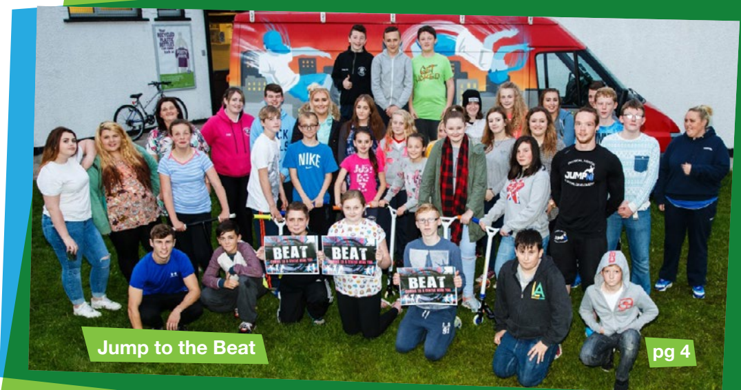
Jump to the Beat