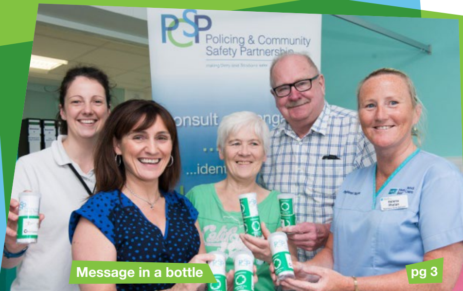
Message in a bottle