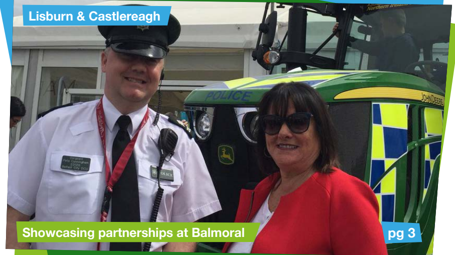
Showcasing partnerships at Balmoral