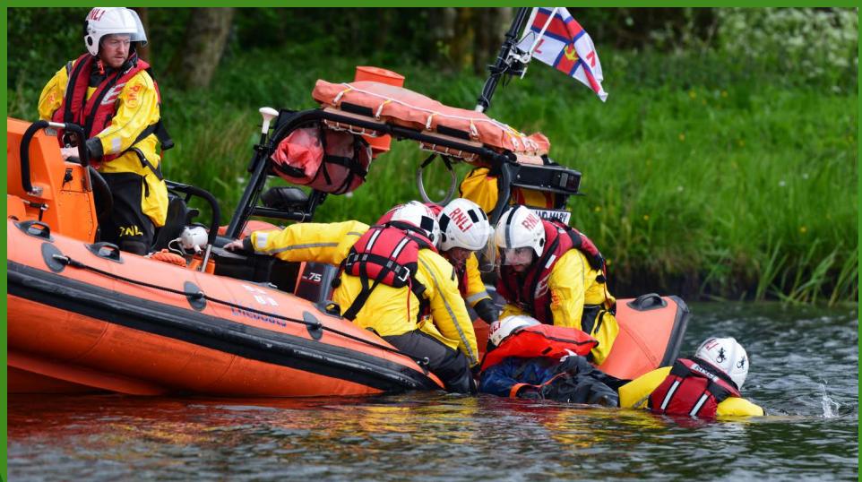
The lifeboat staff showing how they rescue people who get in trouble in the water.