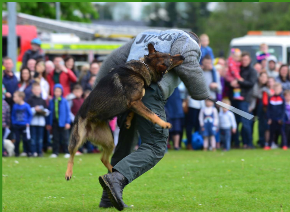
This police dog is not letting go of his man