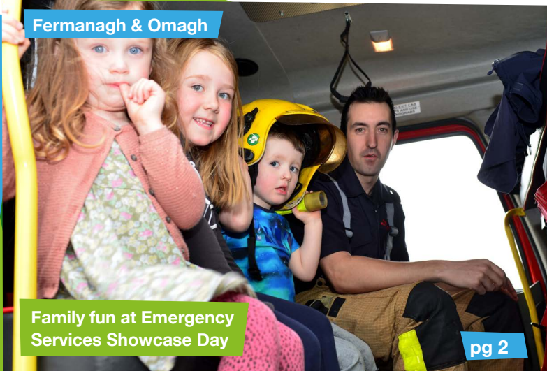
Family fun at Emergency Services Showcase Day