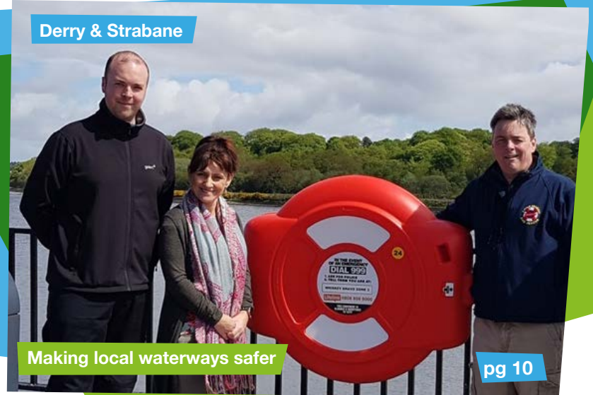
Making local waterways safer