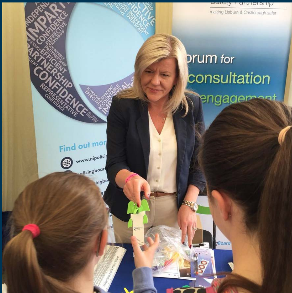
Policing Board staff share out the goodies.