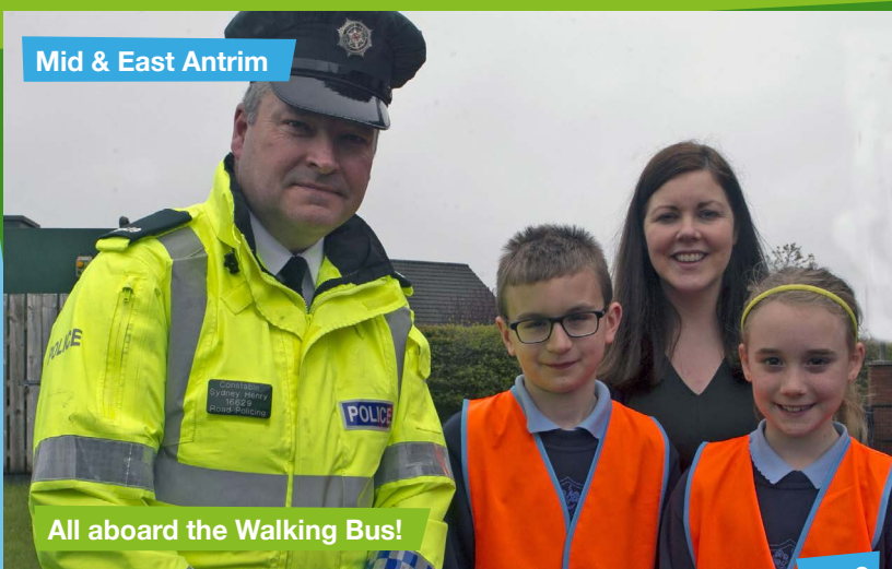
All aboard the Walking Bus!