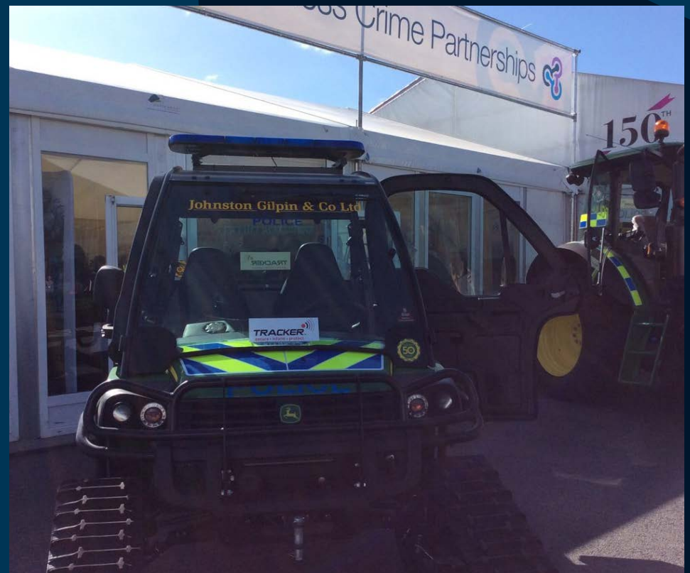
The Rural Crime Partnership was on hand to give out information and safety advice.