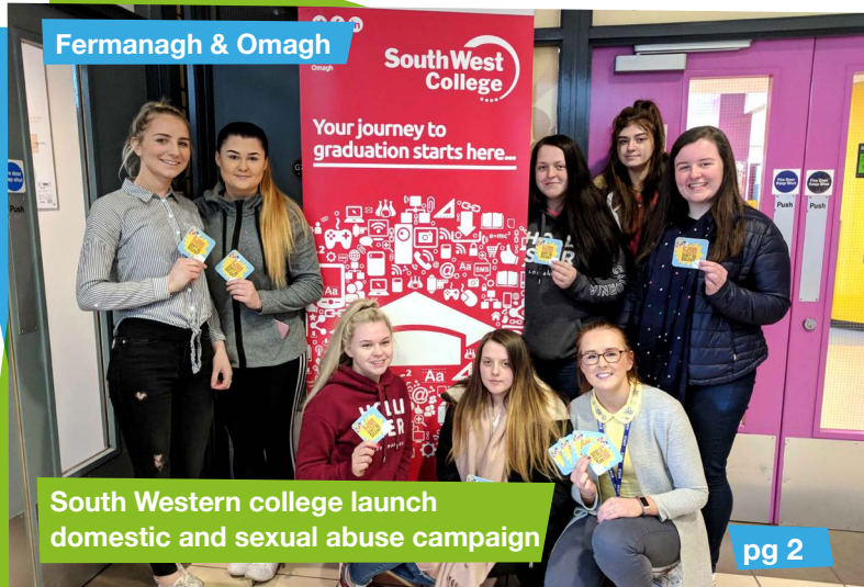
South Western college launch domestic and sexual abuse campaign