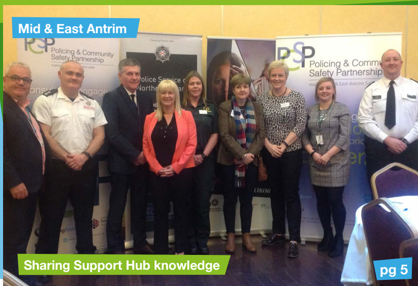
Sharing Support Hub knowledge