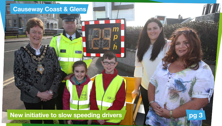
New initiative to slow speeding drivers