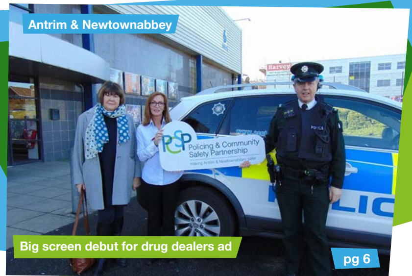
Big screen debut for drug dealers ad