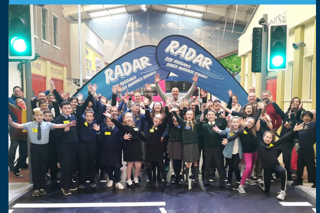
Pupils enjoyed a visit to Radar as part of their road safety poster winning competition prize recently.