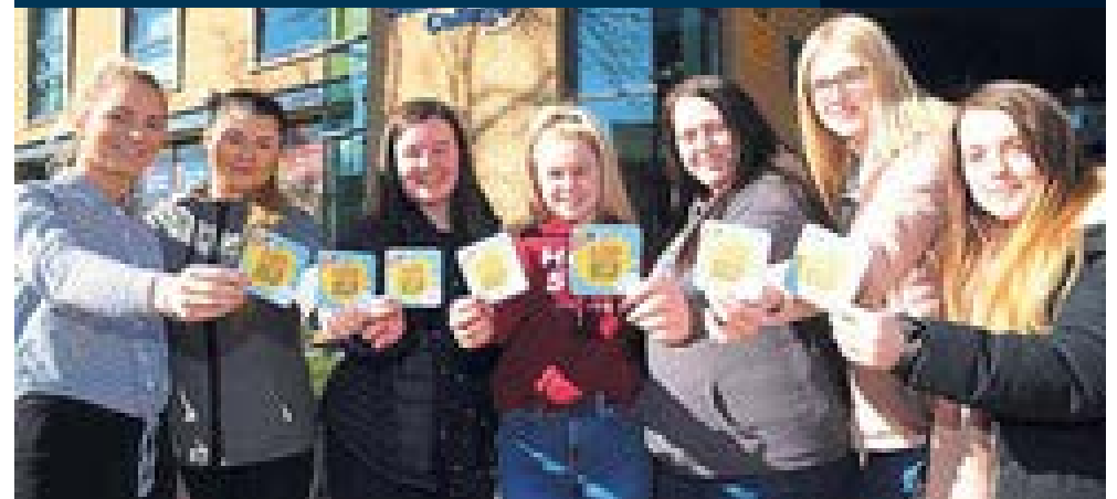
South West College students showcasing their new 'If your partner is violent, don't be silent' beer mats which they will distribute throughout the district.