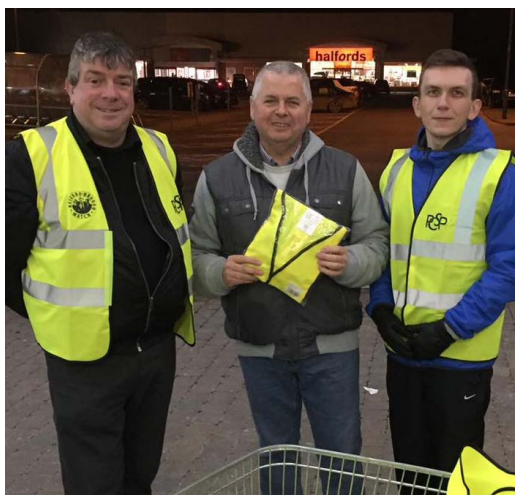
Newry, Mourne & Down PCSP helped Newry, Mourne and Down Road Safety Committee distribute hi vis vests to members of the public at various public locations throughout the Council area. PCSP officers, local community volunteers and members of the PSNI all pitched in with the distribution