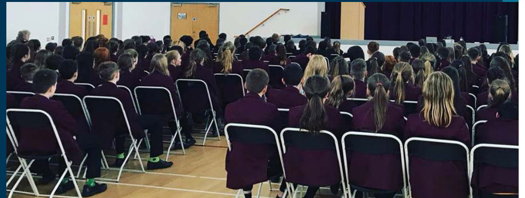
Some of the students finding out about how to shape their digital reputation.

It highlights how they create an image of themselves through the information shared in blogs comments, tweets, snapshots, videos and links and how that can be interpreted.