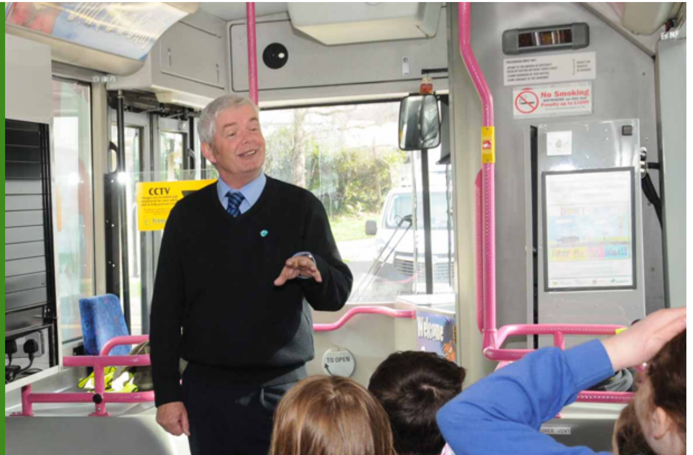
A Translink official explains issues with safety on the organisation's Safety Bus

Beesafe is an imaginative way of teaching Primary Seven pupils how to prevent everyday accidents how to deal with dangerous situations safely and effectively.