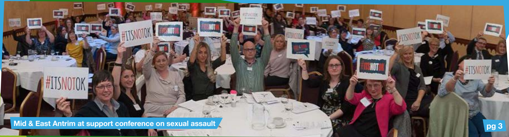
Mid & East Antrim at support conference on sexual assault