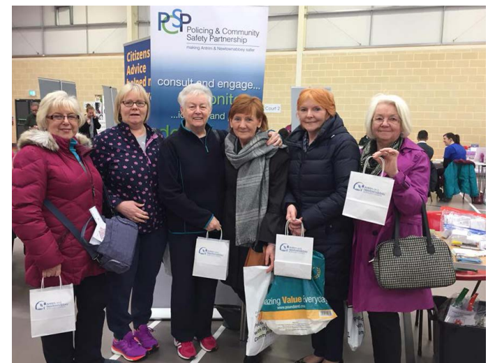
Antrim & Newtownabbey PCSP took part in an emotional wellbeing event in Crumlin at the end of February. The Crumlin Mental Health and Wellbeing Fair showcased some of the service resources available to the community. Pictured at the event are members of Crumlin Senior Citizens Group