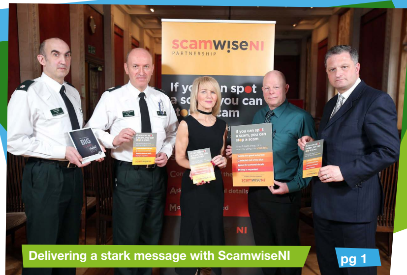
Delivering a stark message with ScamwiseNI