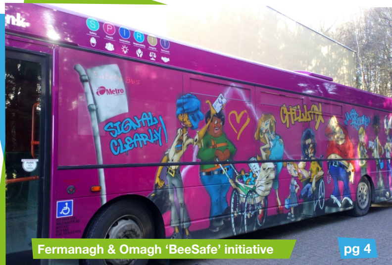
Fermanagh & Omagh 'BeeSafe' initiative