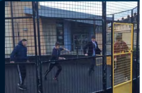
Cage soccer at CKS Community Centre

A series of football coaching sessions have been delivered by the PCSP working alongside Council leisure staff, using the cage to develop individual skills, special tricks, exhibition football and goal scoring techniques.