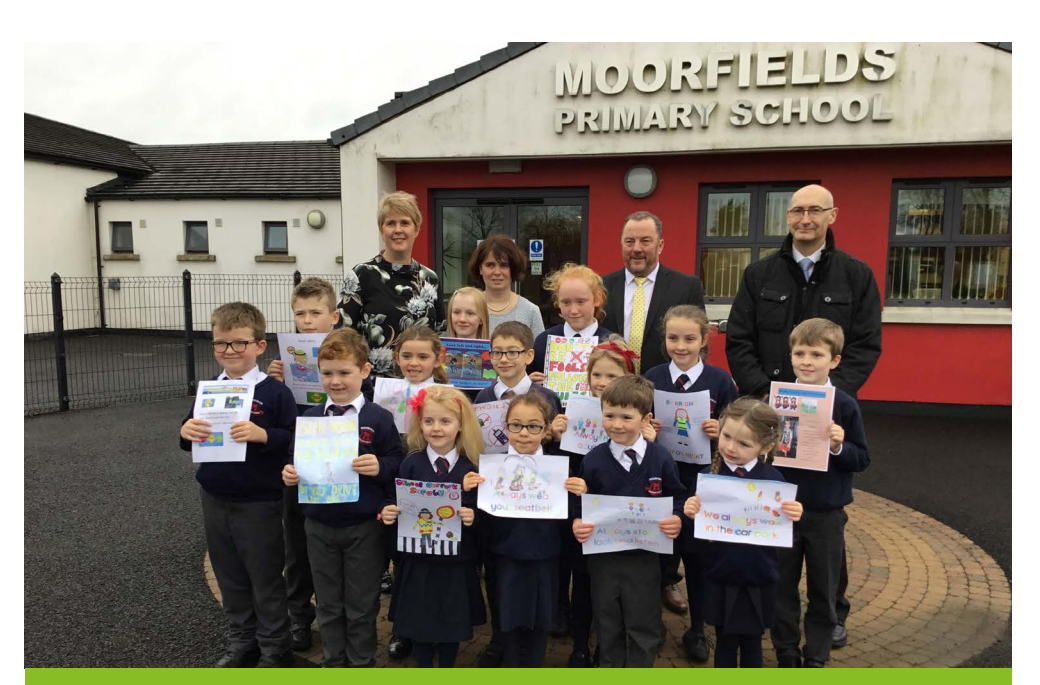
Mid & East Antrim PCSP has funded a road safety calendar and poster competition as part of its first engagement with a rural school. Moorfields PS hosted the PSNI at the school as part of the engagement which involved a road safety talk for both parents and pupils. A group of the children will also attend the Risk Avoidance and Danger Awareness Resource (RADAR) centre in New Year with the PSNI as part of the project. Pictured are pupils from the school