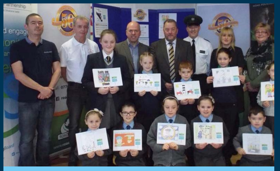
Local schoolchildren with their entries