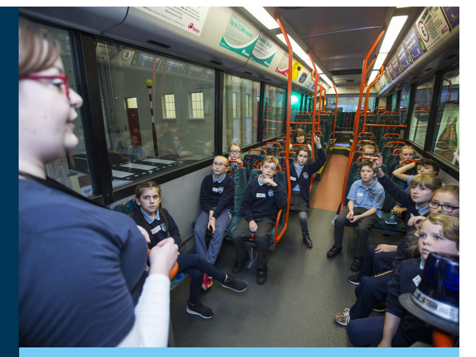
A transport themed part of the visit to the RADAR facility in Belfast organised by Causeway Coast & Glens PCSP