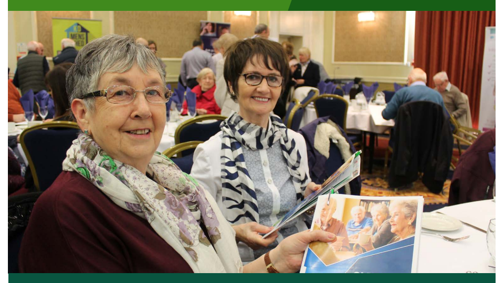
Members of the audience at the Keep Safe Keep Well event

Information stands on key service areas were also on display, providing a wide range of information on issues that affect older people.