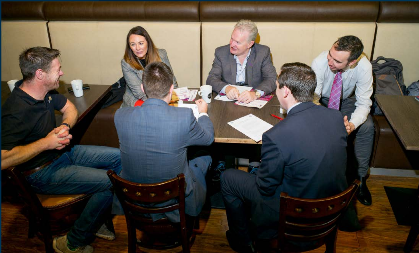
Members of the business community meet at a networking breakfast supported by Derry & Strabane PCSP.