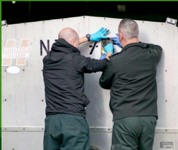
Derry & Strabane PCSP supported a PSNI trailer marking event where people brought along trailers and farming equipment to be marked as well as receiving crime prevention guidance. The free service sees trailers and horseboxes given a security marking which can deter thieves and helps police quickly establish the legitimate owner of the vehicle.