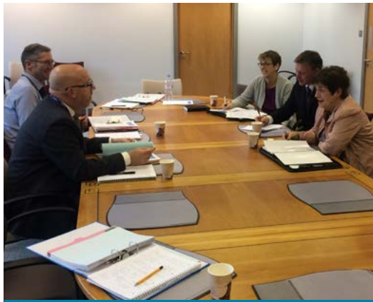
Policing Board and DoJ representatives with PCSPs at a recent governance meeting.