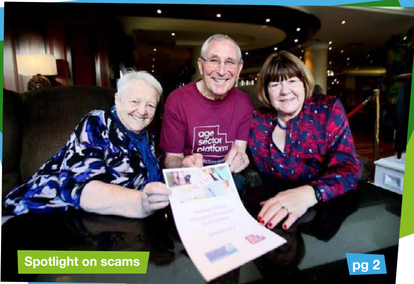
Spotlight on scams