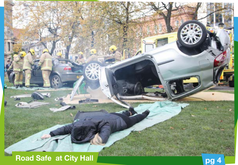
Road Safe at City Hall