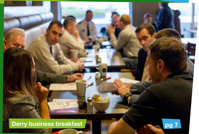
Derry business breakfast