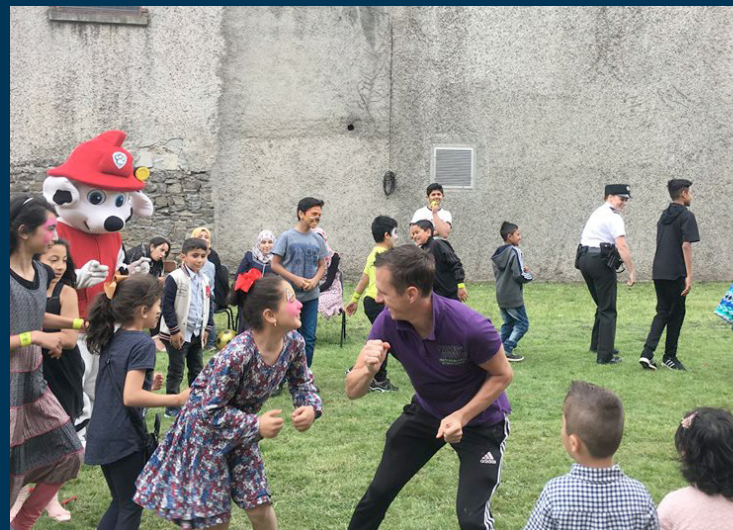
Armagh, Banbridge & Craigavon PCSP and local police officers were invited along to help the Muslim Association of Newry celebrate Eid al-Fitr and join in their end of Ramadan celebrations.