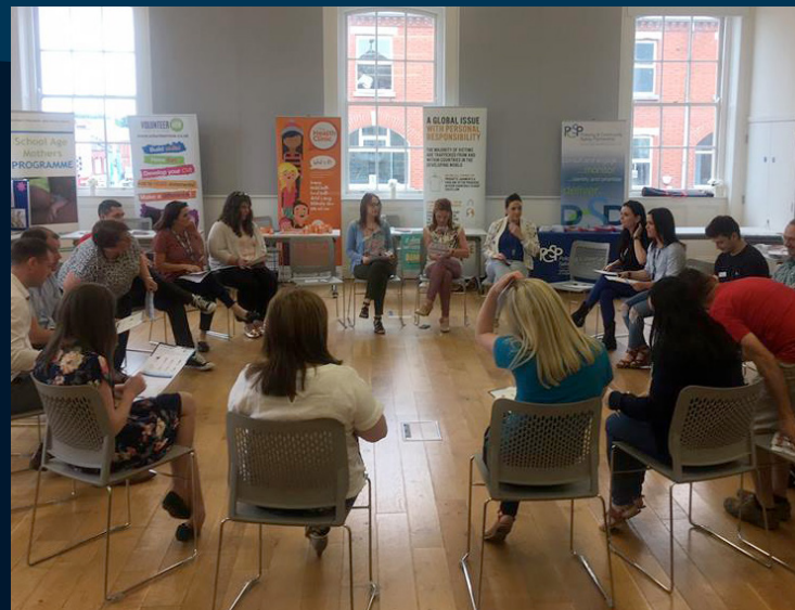
Armagh, Banbridge & Craigavon PCSP and SDACT Connections Service hosted a Big Breakfast Networking Event in Banbridge to promote understanding and working arrangements to look at how best to develop partnerships to tackle drugs & alcohol issues in the area.