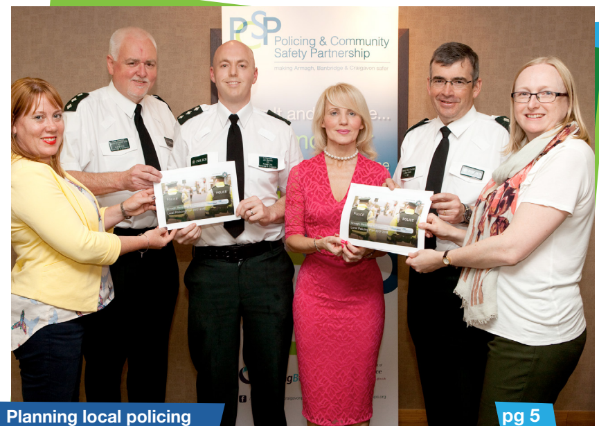
Planning local policing