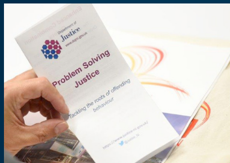
Problem solving justice

One of the pilots being run under Problem Solving Justice is the Concern Hub