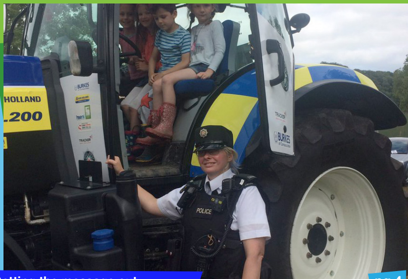
Getting the message out