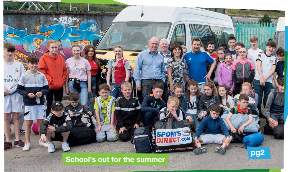
School's out for the summer