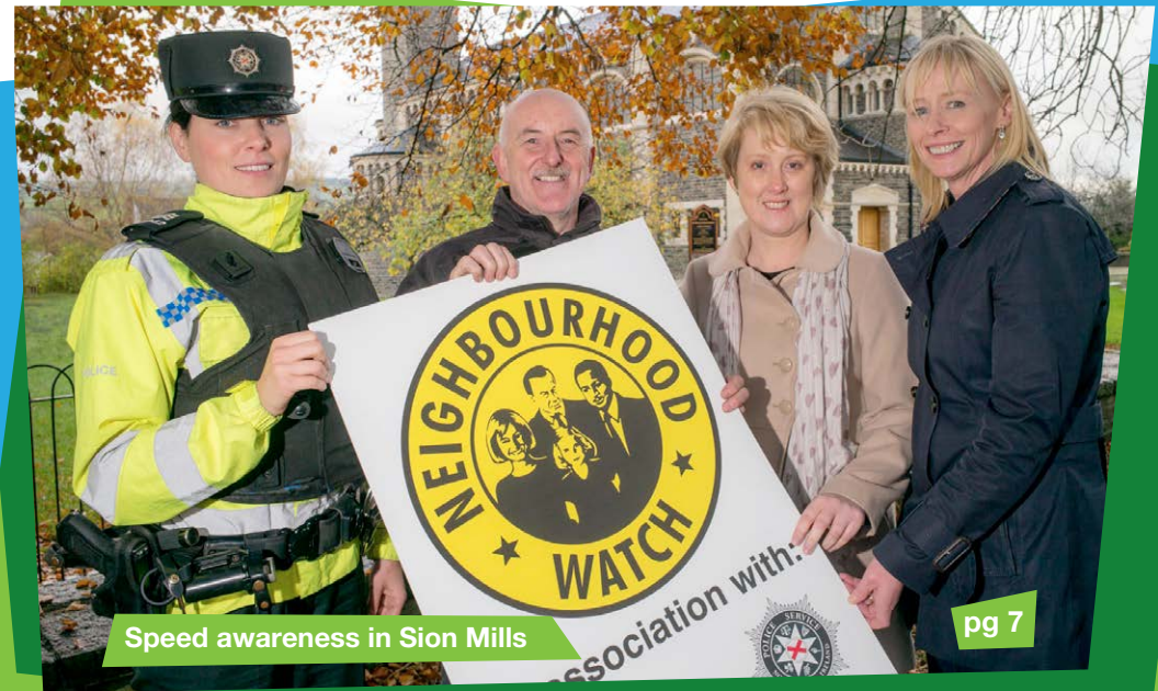
Speed awareness in Sion Mills