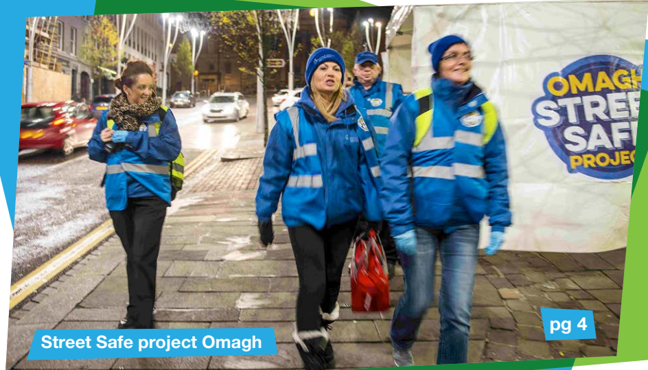
Street Safe project Omagh