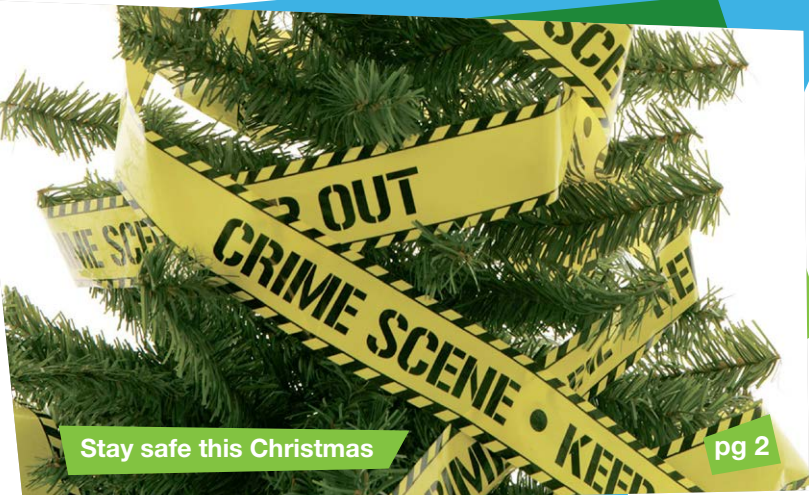
Stay safe this Christmas