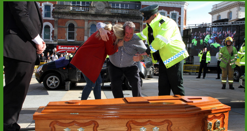
The death driving re-enactment depicts the devastating aftermath of a road death.