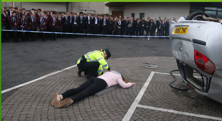
Students from Lisburn & Castlereagh schools look on at the Cool FM Road Safe Road Show.