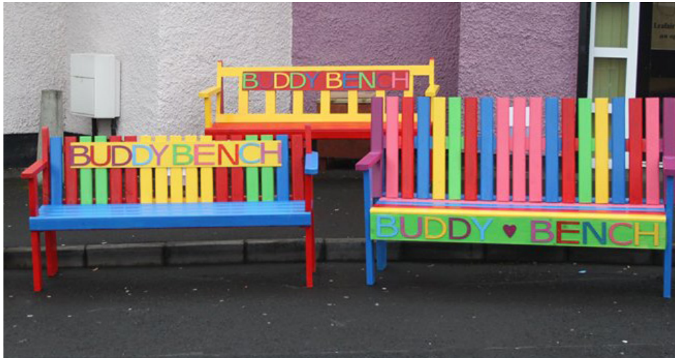
Some of the Buddy Benches.