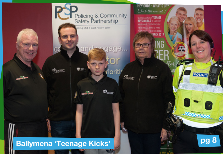
Ballymena 'Teenage Kicks'