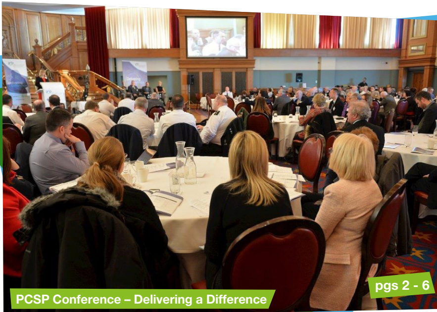
PCSP Conference – Delivering a Difference