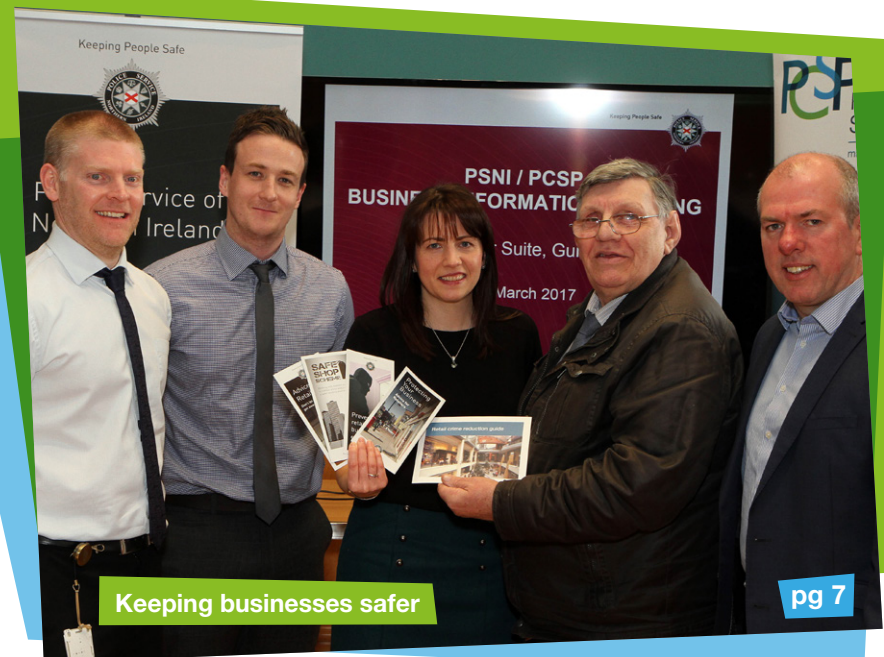
Keeping businesses safer