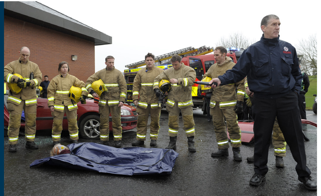
The hard hitting demonstration.