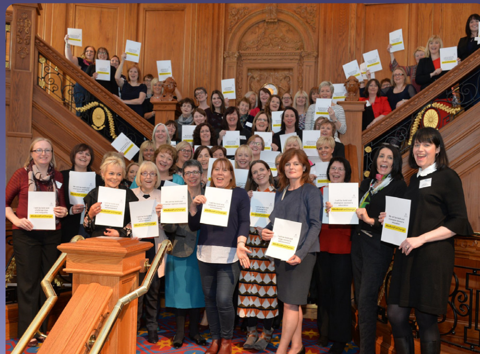
Delegates showing support for International Women's Day at the Conference.

The aim of the conference was to focus on how PCSPs can continue to deliver a difference and contribute to the outcomes set within the draft Programme for Government. It was also an opportunity to highlight what has been achieved since their establishment.