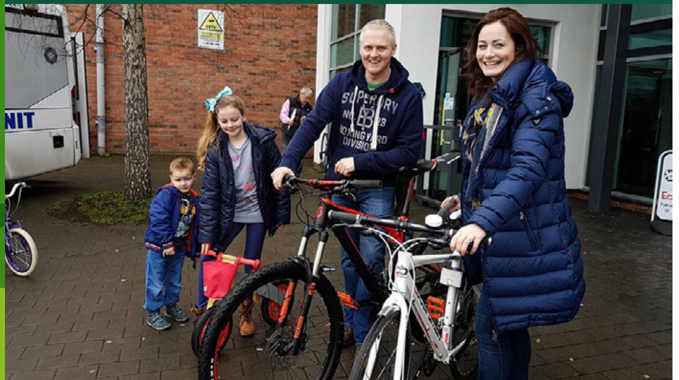
One of the local families who got their bikes marked by the PCSP and PSNI.