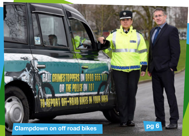
Clampdown on off road bikes