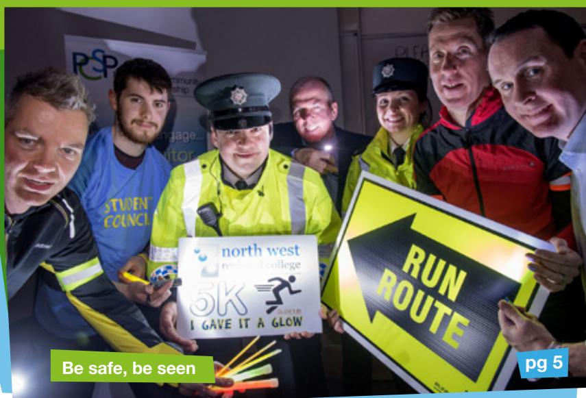
Be safe, be seen