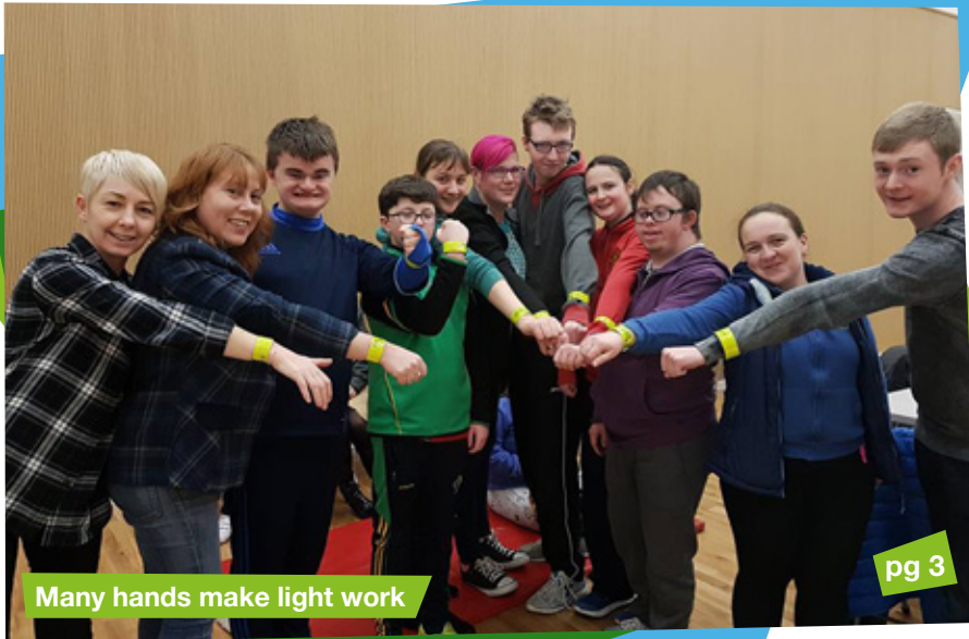
Many hands make light work