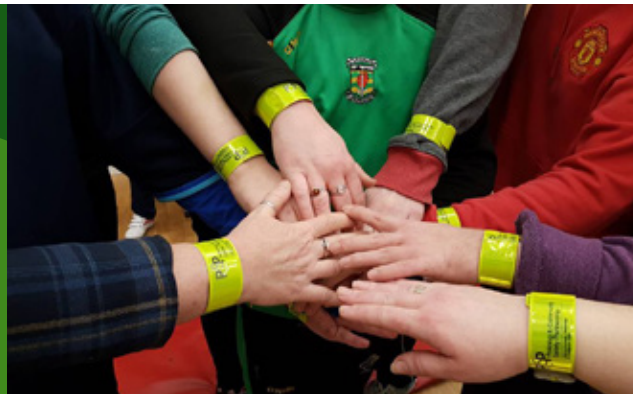
Many hands make light work at Keady Youth Club!

Representatives from Armagh, Banbridge & Craigavon PCSP went along to Keady's Enable Youth Group to talk to them about personal safety. Enable is a local voluntary organisation providing projects for people with learning disabilities and/or autism so the PCSP talked through the importance of keeping safe in the home, when out and about using cash machines or shopping and how to contact the police in an emergency.