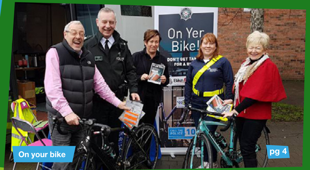
On your bike