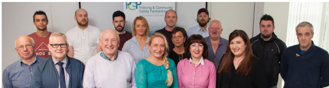
Bar staff from the Causeway Coast & Glens area at a training session in Coleraine Council Offices.

Do you have any ideas about how to keep people safer online? If so, let us know. Contact us on our Facebook page or email pcsp@nipolicingboard.org.uk .