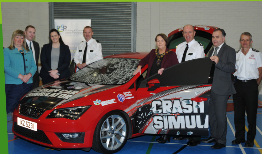
Get the show on the road