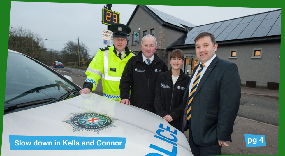
Slow down in Kells and Connor