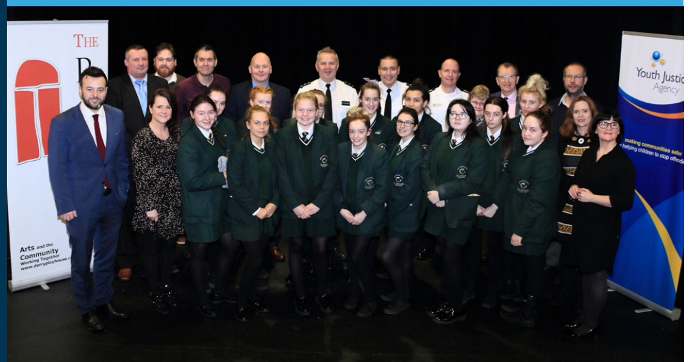
Caption Pictured at the launch of the short films are (l-r):