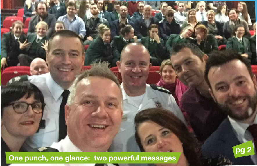
One punch, one glance: two powerful messages