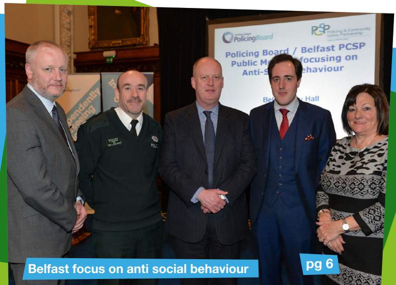
Belfast focus on anti social behaviour