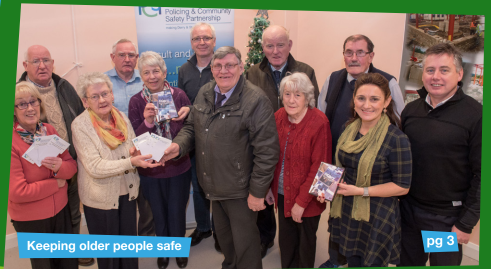
Keeping older people safe