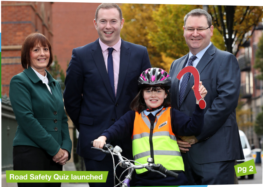
Road Safety Quiz launched