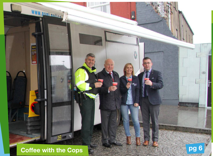
Coffee with the Cops