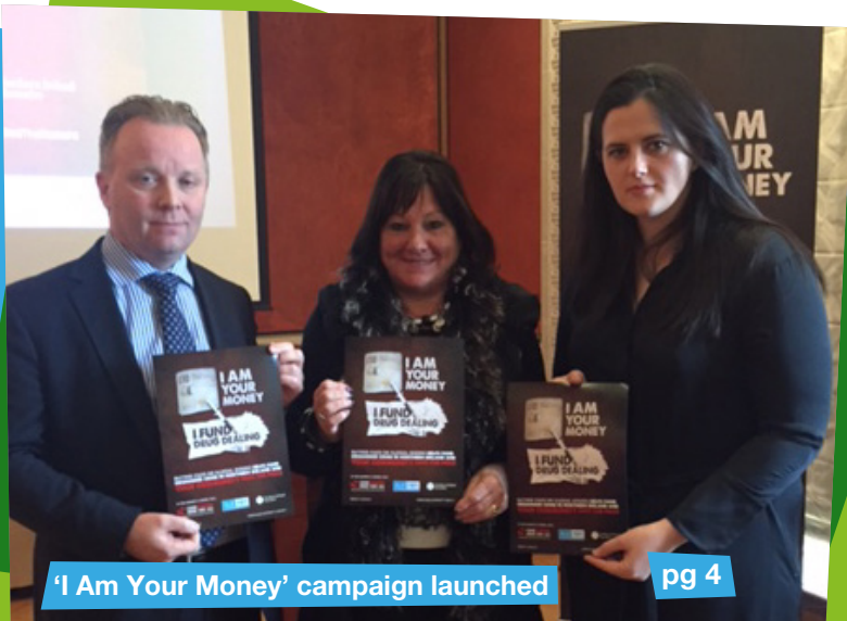
'I Am Your Money' campaign launched