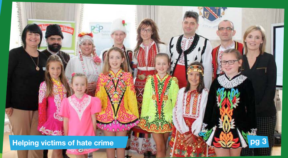
Helping victims of hate crime