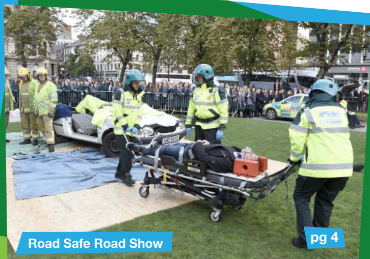
Road Safe Road Show