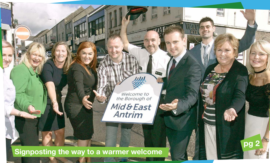
Signposting the way to a warmer welcome