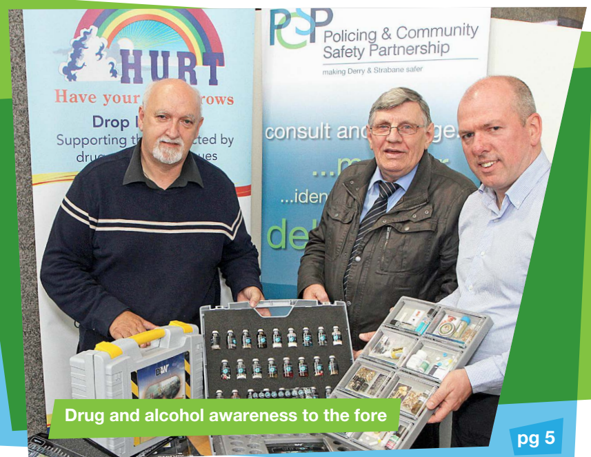
Drug and alcohol awareness to the fore