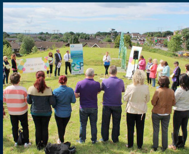
Participants at the 'Circle of Hope' event.