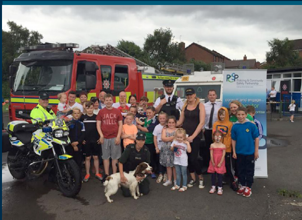
Young members of Suffolk Youth Club had a great day engaging with local Police units and the NIFRS.