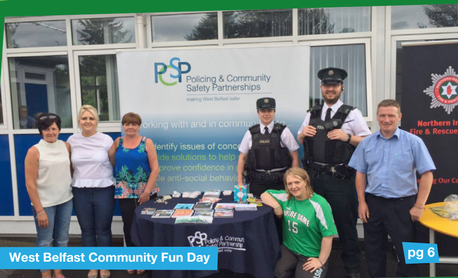
West Belfast Community Fun Day