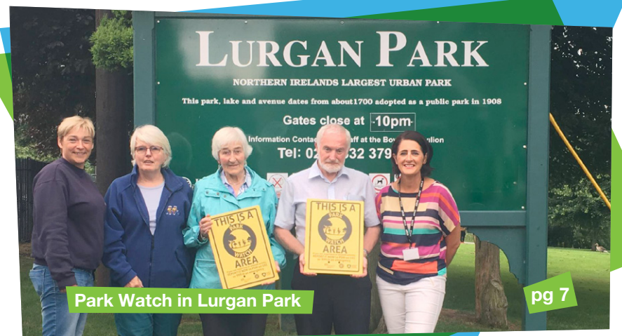
Park Watch in Lurgan Park