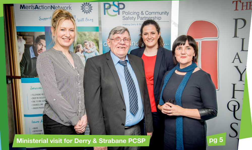
Ministerial visit for Derry & Strabane PCSP