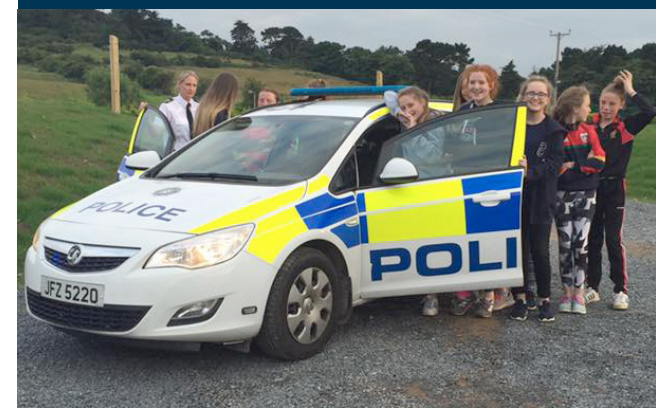
Young people engaging with the PSNI during the Programme

The initiative will continue to run throughout August every Friday night from 7pm-9pm.