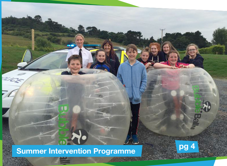
Summer Intervention Programme