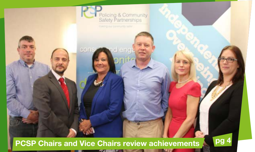
PCSP Chairs and Vice Chairs review achievements