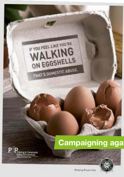
Campaigning against domestic abuse