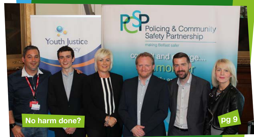
No harm done?