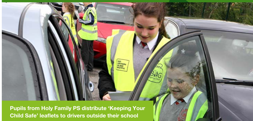
Pupils from Holy Family PS distribute ‘Keeping Your Child Safe’ leaflets to drivers outside their school

To get your hands on the advice leaflets contact the PCSP on 028 71 253 253 or pcsp@derrystrabane.com .