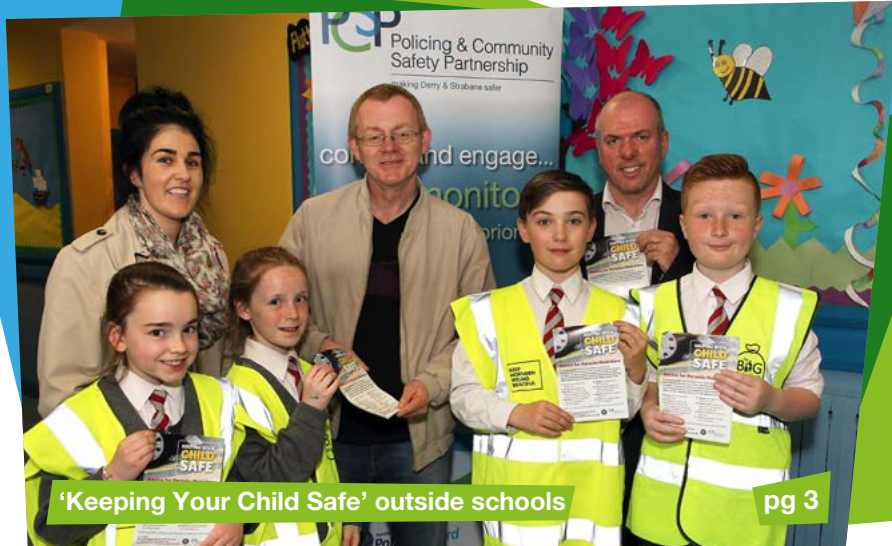
'Keeping Your Child Safe' outside schools