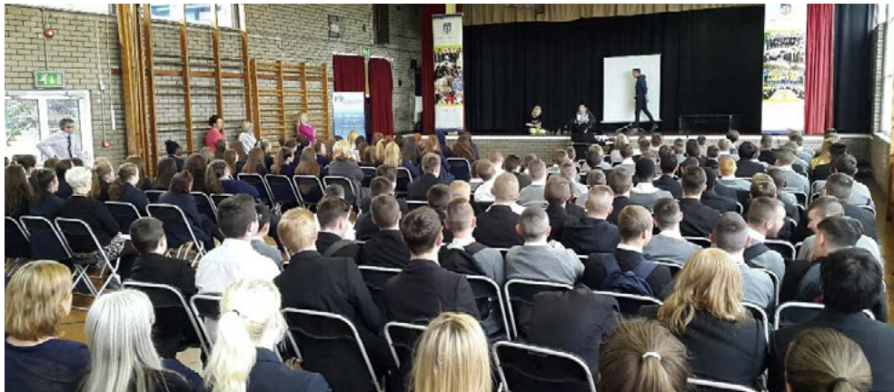
Some of the students who watched 'Think how you drink' in west Belfast during June.