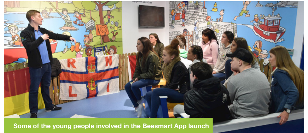
Some of the young people involved in the Beesmart App launch