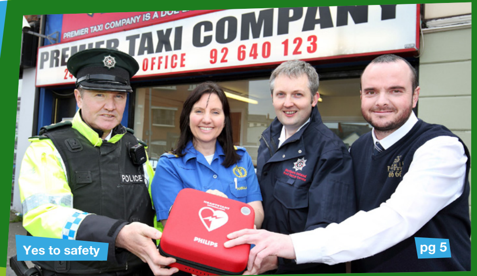
Yes to safety