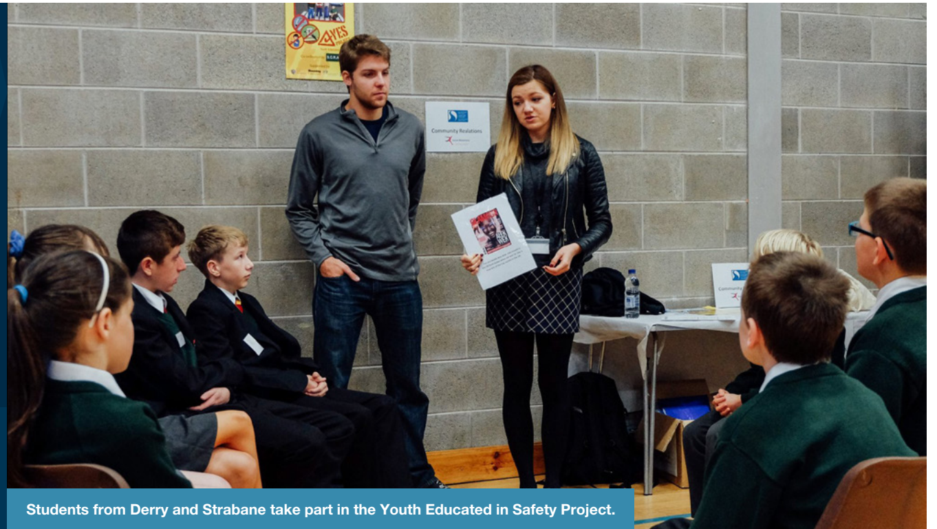
Students from Derry and Strabane take part in the Youth Educated in Safety Project.

Just under 1500 young people across Derry and Strabane took part in the YES - Youth Educated in Safety - Project over the past few months. The project, delivered by Shantallow Community Resident's Association and funded by Derry and Strabane PCSP, Department of Social Development, the Council's Community Relations Programme and the Housing Executive, provides a multi-agency health and safety awareness programme to primary school children in the area. The interactive workshops, delivered by a range of agencies, covered internet, river, pet and firework safety, drug and alcohol misuse and anti-social behaviour.