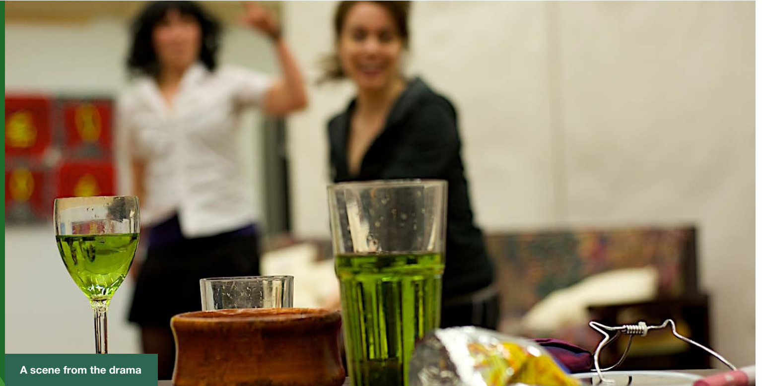
A scene from the drama

Developed by a team of doctors, NSPCC professionals and teachers, 'Last Orders' is a professional and