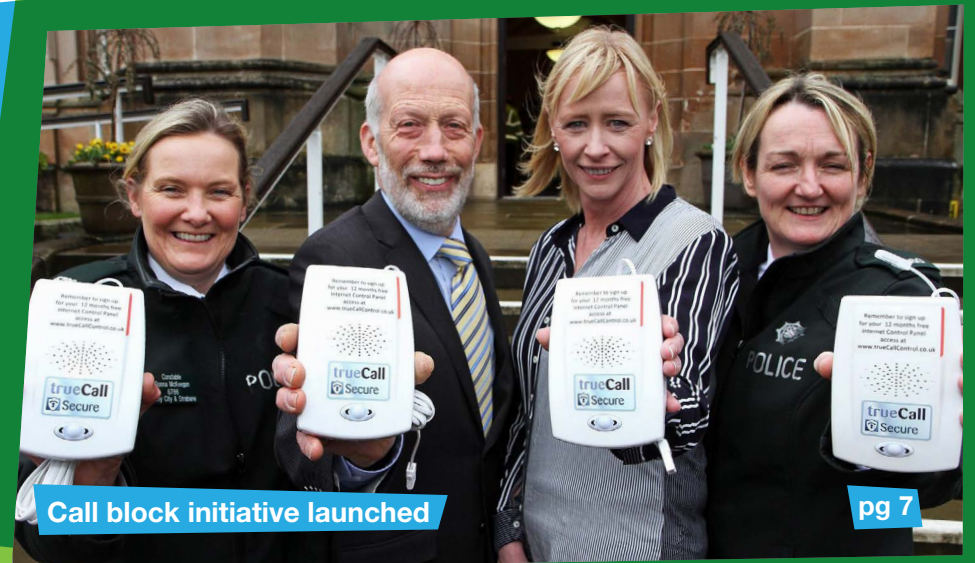
Call block initiative launched