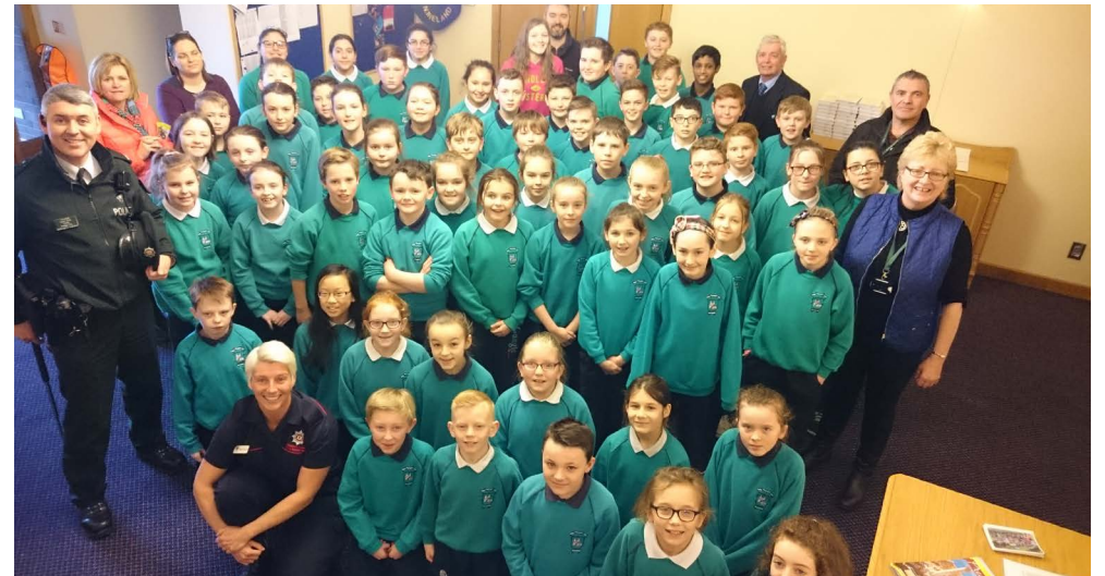
Pupils pictured at the Bee Safe event held in Armagh