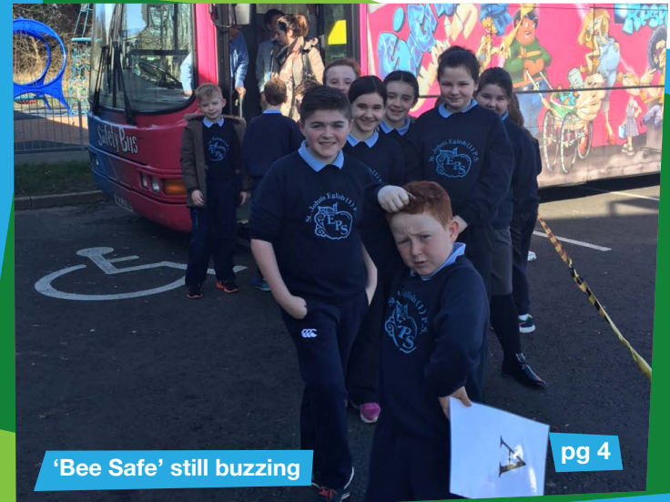
'Bee Safe' still buzzing