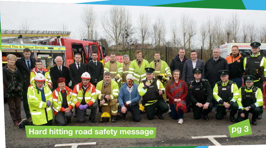
Hard hitting road safety message