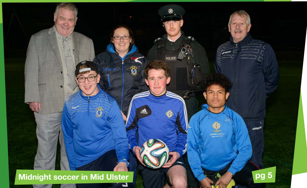
Midnight soccer in Mid Ulster